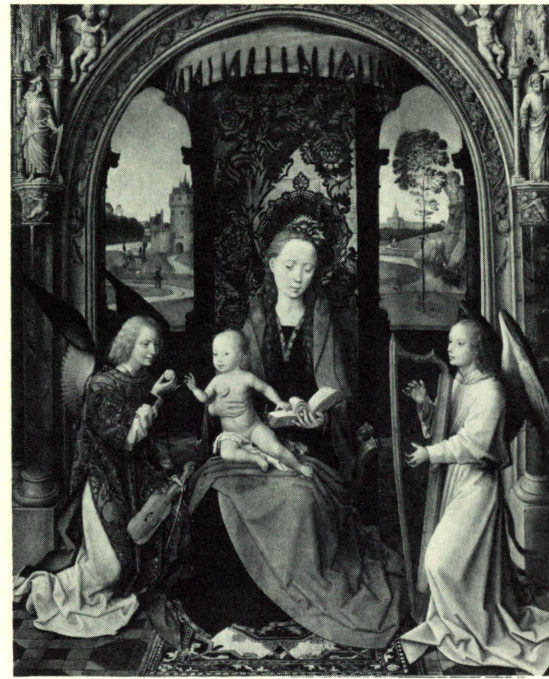
MEMLING. Madonna and Child with Angels