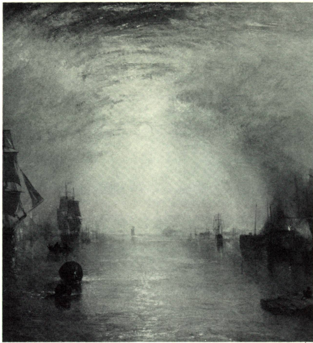
TURNER. Keelmen Heaving in Coals by Moonlight (detail)