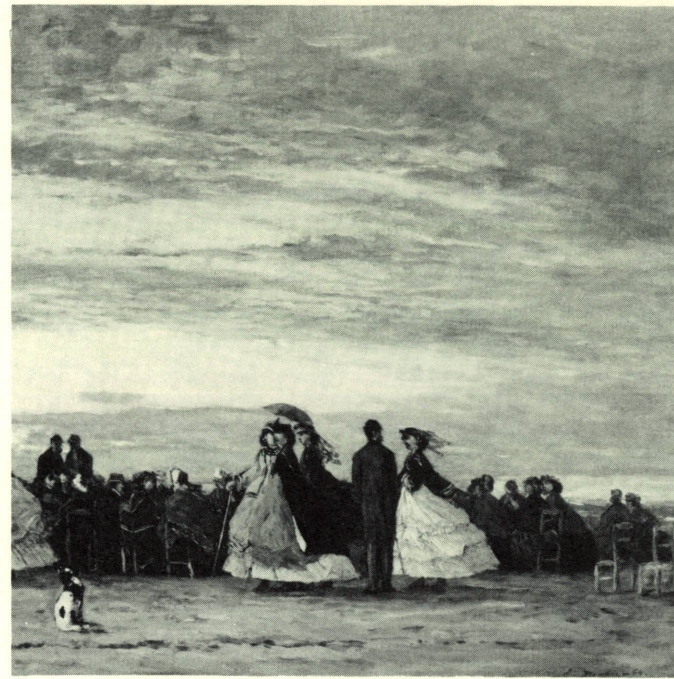
BOUDIN. The Beach at Villerville (detail)

*11" x 14" color reproductions with texts for sale this week—25c each. Minimum mail order $1.00.