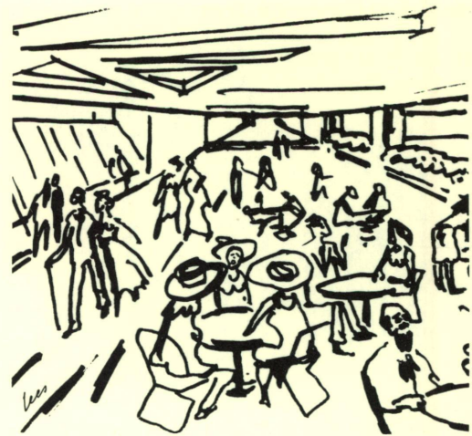
Herman and Lees Associates, Cambridge

A loan exhibition from France, comprising forty-three engravings and gouaches of French fireworks from the seventeenth to the nineteenth century, is on view in the East Corridor Gallery. These works illustrate various celebrations of court life, when fireworks were an integral part of the festivities. The eighteenth-century fireworks spectacle which opened The Eye of Thomas Jefferson exhibition June 1 is documented in a fourteen-minute audio-visual presentation. It is being shown in the Gallery Auditorium at 1 and 6:30 p.m. daily through September 6.