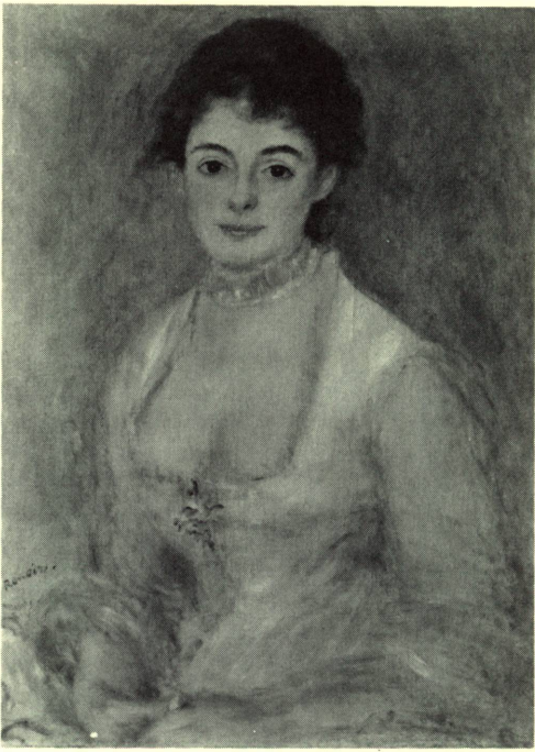
RENOIR. Madame Henriot