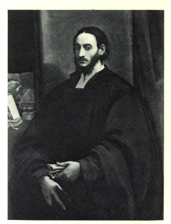
SEBASTIANO DEL PIOMBO. Portrait of a Humanist