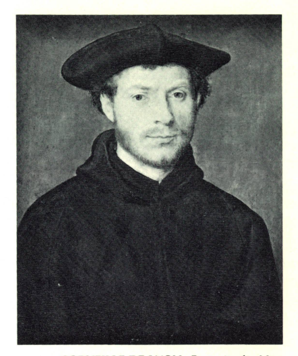
CORNEILLE DE LYON. Portrait of a Man