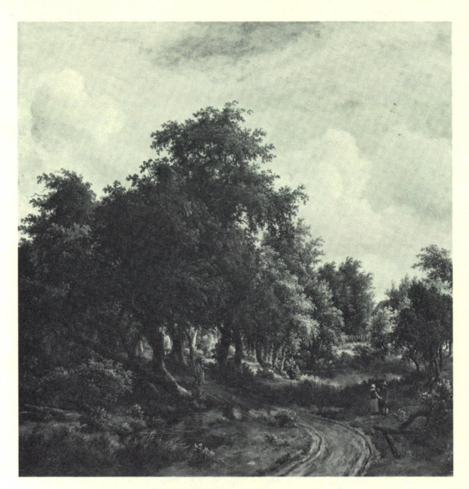
HOBBEMA, A Wooded Landscape (detail)

All concerts, with intermission talks by members of the National Gallery Staff, are broadcast by Station WGMS-AM (570) and FM (103.5).