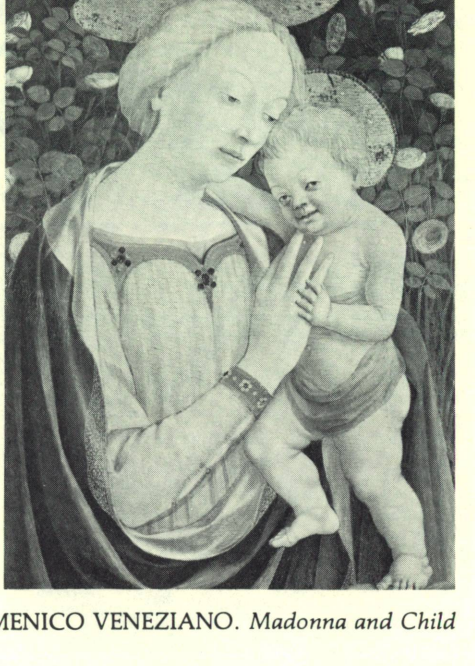
DOMENICO VENEZIANO, Madonna and Child