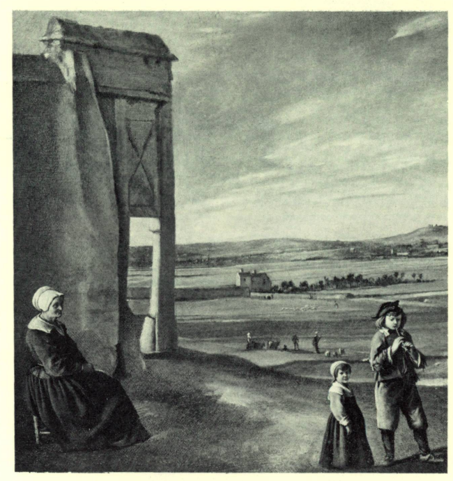
LOUIS LE NAIN. Landscape with Peasants (detail)

Inquiries concerning the Gallery's education services should be addressed to the Education Office or telephoned to [202] 737-4215, ext. 272.