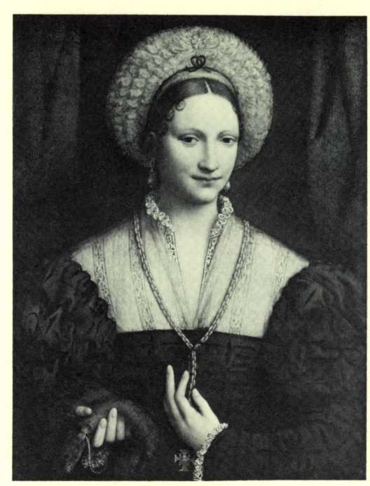
LUINI. Portrait of a Lady

All concerts, with intermission talks by members of the National Gallery Staff, are broadcast by Station WGMS-AM (570) and FM (103.5).