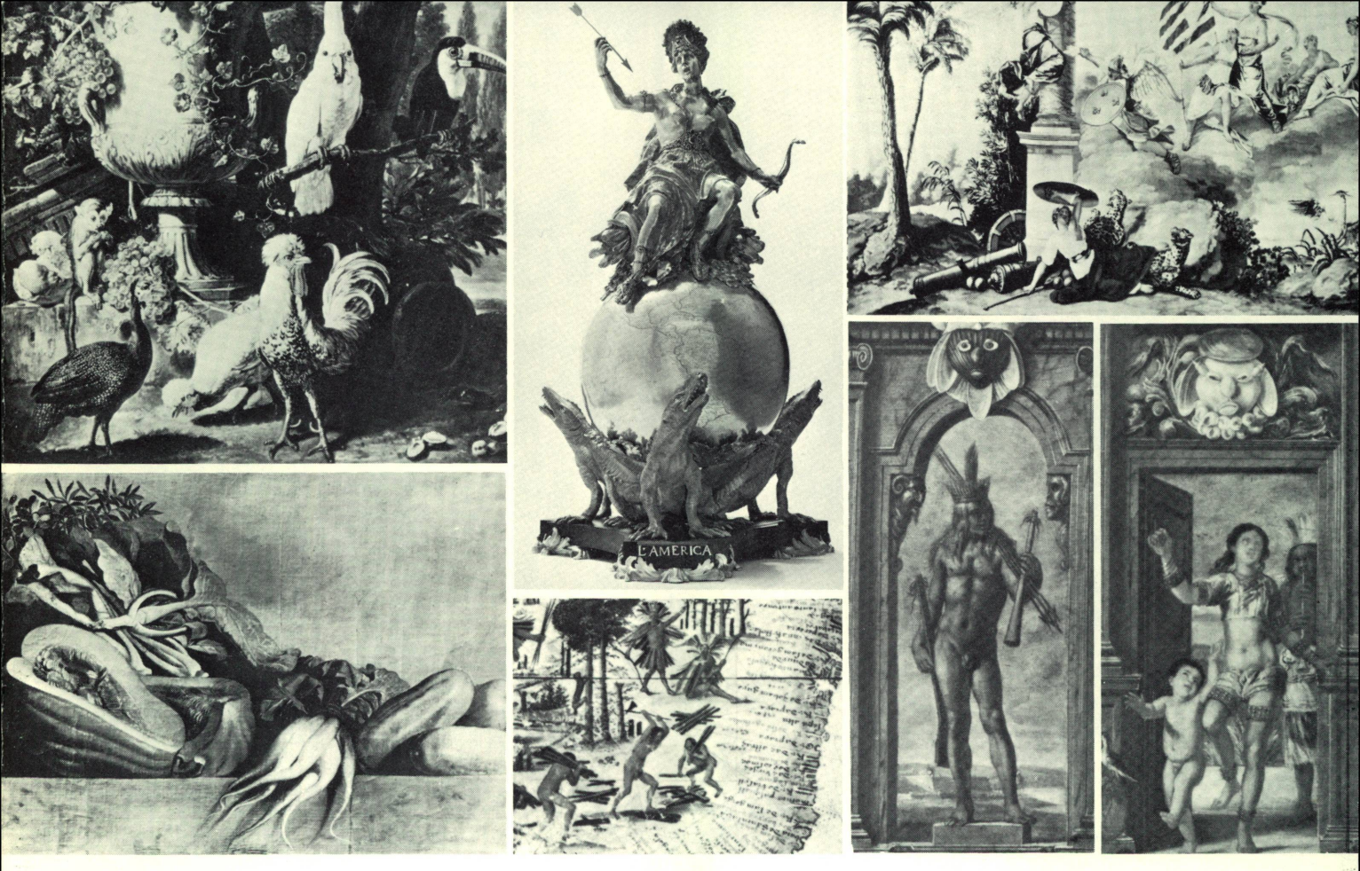
TOP: WEENIX. American Menagerie (detail); VACCARO. America; LE BARBIER. America (detail) BOTTOM: ECKHOUT. Brazilian Fruits (detail); PEDRO REINEL AND LOPO HOMEN. Map of South America (detail); VAN KESSEL. America (details)