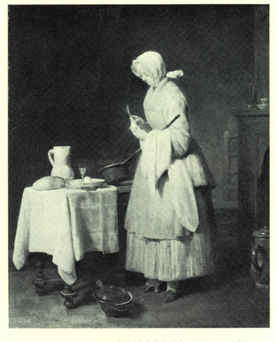
CHARDIN. The Attentive Nurse

*11" x 14" color reproductions with texts for sale this week—25c each. If mailed, 35c each.