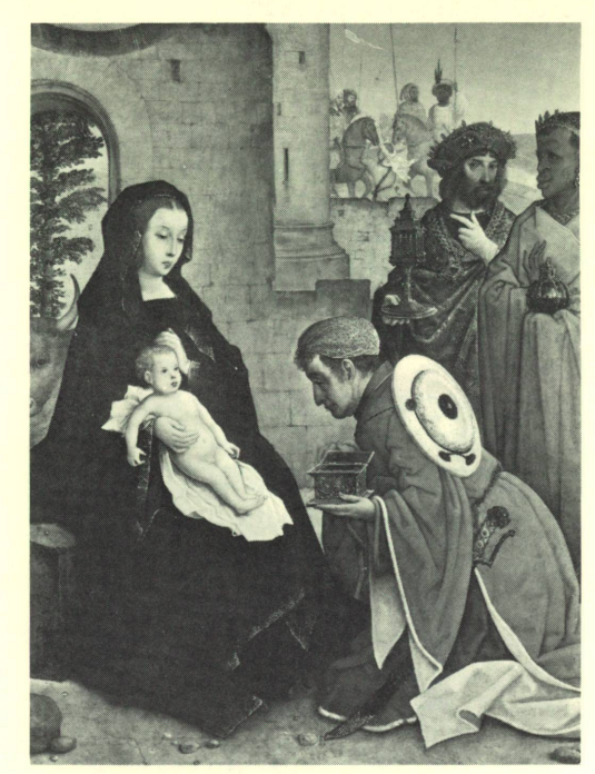
IUAN DE FLANDES. The Adoration of the Magi

†Color postcards with texts for sale this week—10c each, postpaid.