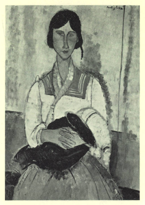
MODIGLIANI. Gypsy Woman with Baby

#8" x 10" black-and-white photographs for sale this week—$1.00 each; descriptive text available at no charge.