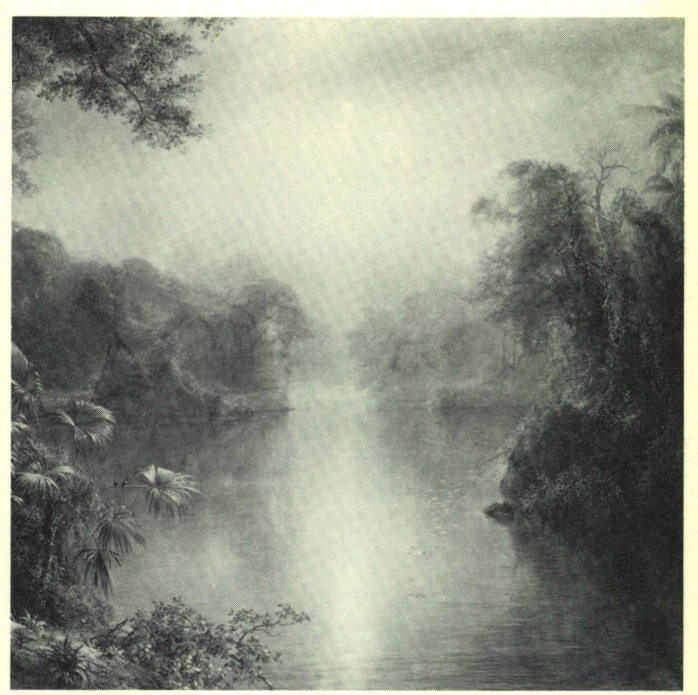
CHURCH. Morning in the Tropics (detail)

MONDAY, November 24 through SUNDAY, November 30