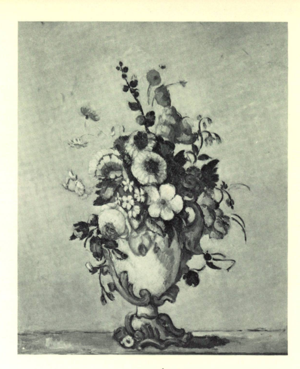
CÉZANNE. Vase of Flowers

All concerts, with intermission talks by members of the National Gallery Staff, are broadcast by Station WGMS-AM (570) and FM (103.5).