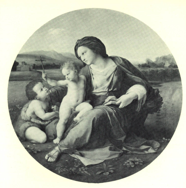
RAPHAEL. The Alba Madonna

For reproductions and slides of the collection, books and other related publications, self-service rooms are open daily near the Constitution Avenue entrance.