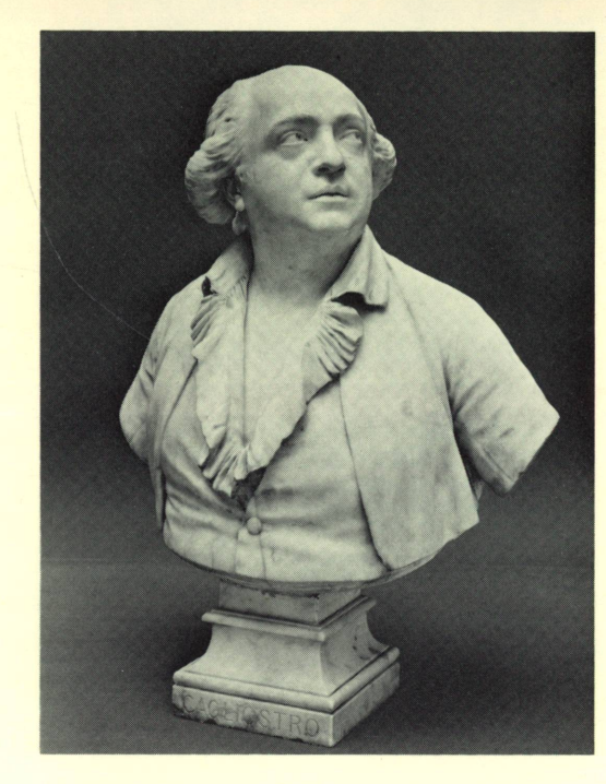
HOUDON. Giuseppe Balsamo, Conte di Cagliostro

*11" x 14" color reproductions with texts for sale this week — 25¢ each. If mailed, 35¢ each.