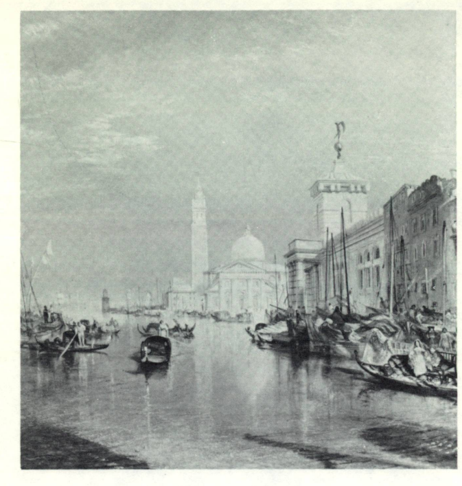
TURNER. Venice: Dogana and San Giorgio Maggiore (detail)