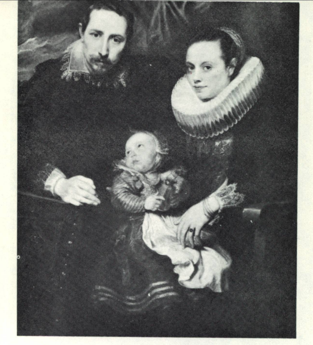
VAN DYCK. A Family Group The Hermitage, Leningrad

The Gallery's summer hours are now in effect through Labor Day. Monday through Saturday, the Gallery is open from 10 a.m. to 9 p.m. and on Sunday from 12 noon to 9 p.m. The Gallery's cafeteria is open Monday through Saturday 10 a.m. to 7:30 p.m. and on Sunday from 1 to 7 p.m.