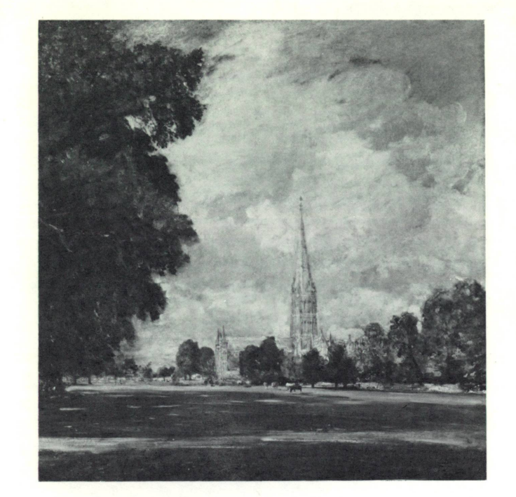
CONSTABLE. A View of Salisbury Cathedral (detail)