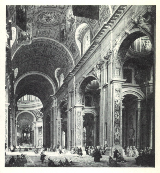
PANINI. Interior of Saint Peter's, Rome (detail)