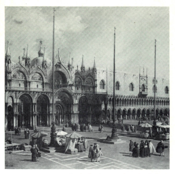
CANALETTO. The Square of Saint Mark's (detail)