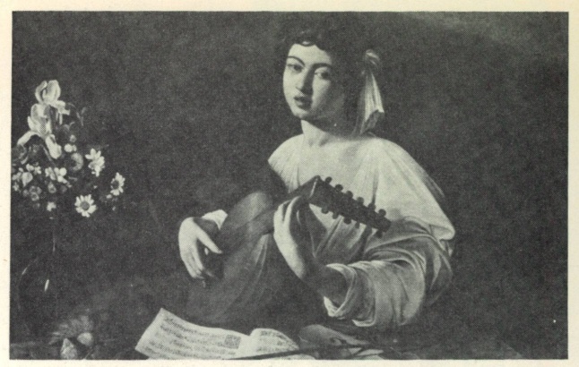
CARAVAGGIO. Lute Player The Hermitage, Leningrad

Jacques Callot: Prints and Related Drawings will be on view at the Gallery through September 14. The Sunday Lectures for June 15, 22, and 29 will be given in conjunction with the exhibition. (Check inside listing for details.)