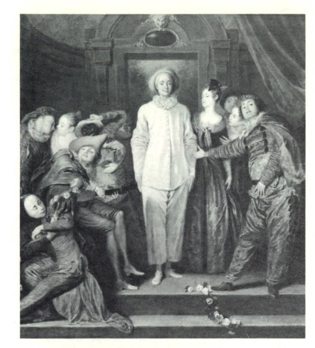
WATTEAU. Italian Comedians (detail)

*11" x 14" color reproductions with texts for sale this week — 25% each. If mailed, 35% each.