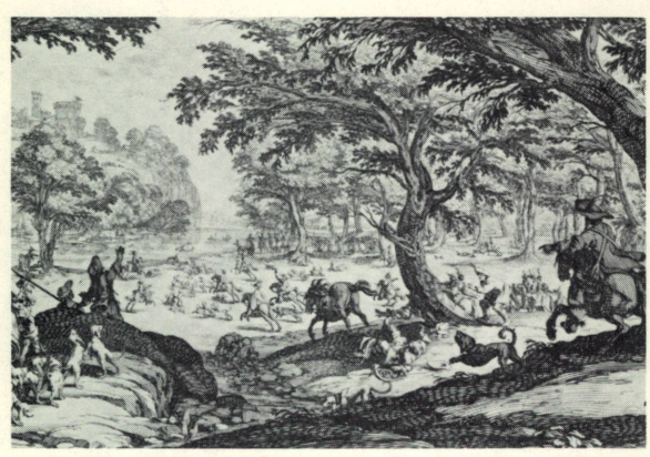
CALLOT. The Stag Hunt (detail)