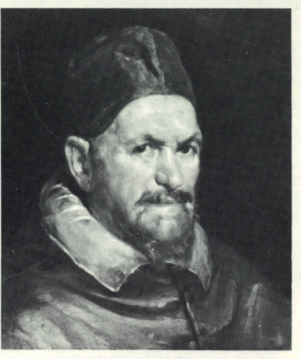
VELÁZQUEZ. Pope Innocent X

TOUR Introduction to the Collection. Rotunda Mon. through Sat. 11:00 & 3:00; Sun. 5:00