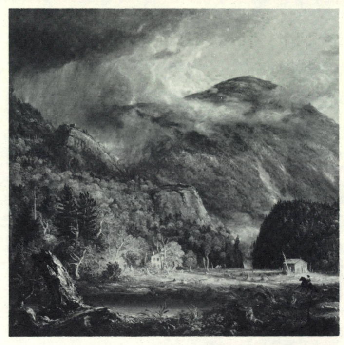
COLE. The Notch of the White Mountains (Crawford Notch) (detail)

All concerts, with intermission talks by members of the National Gallery Staff, are broadcast by Station WGMS-AM (570) and FM (103.5).