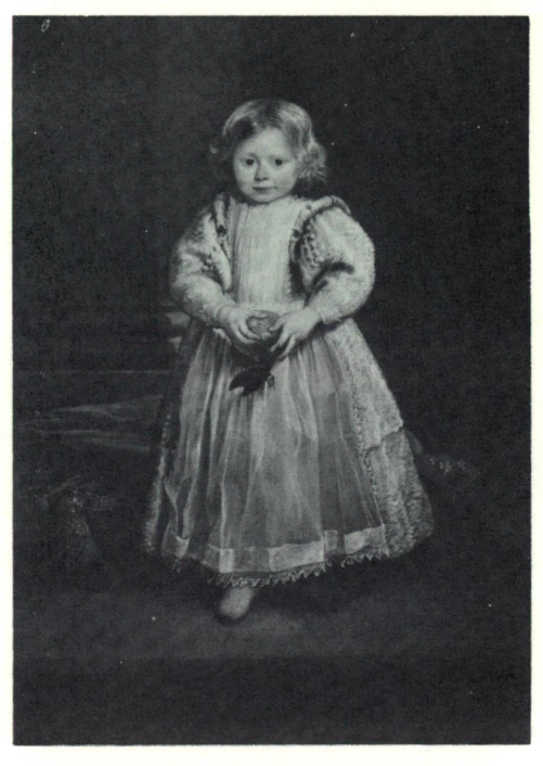
VAN DYCK. Clelia Cattaneo, Daughter of Marchesa Elena Grimaldi

*11" x 14" color reproductions with texts for sale this week-25c each. If mailed, 35c each.