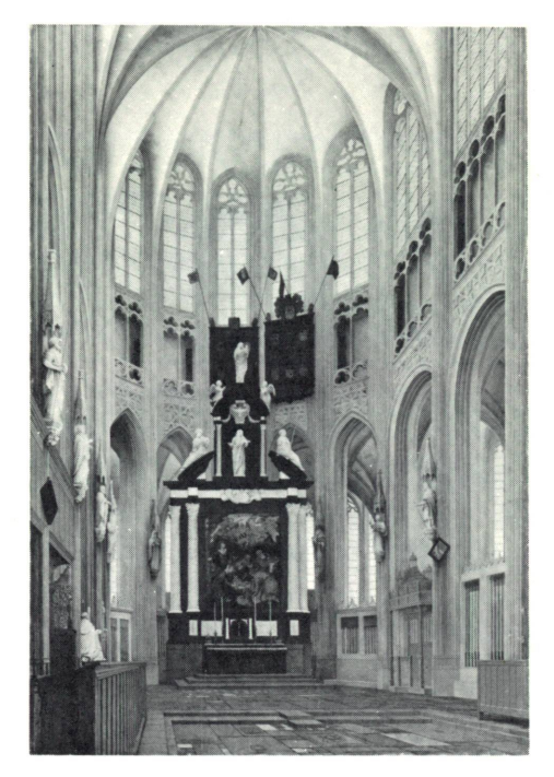
SAENREDAM. Cathedral of Saint John at s'Hertogenbosch