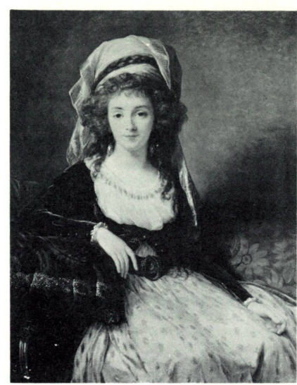
VIGÉE-LEBRUN. Portrait of a Lady