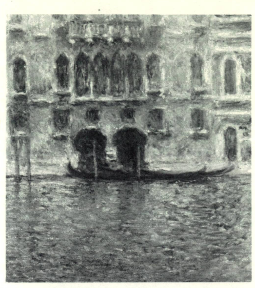
MONET. Palazzo da Mula, Venice (detail)

†8" x 10" black-and-white photographs for sale this week—$1.00 each; descriptive text available at no charge.