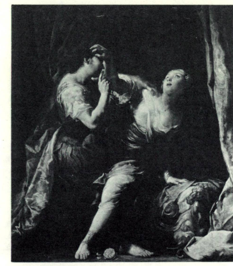
CRESPI. Lucretia Threatened by Tarquin

*11" x 14" color reproductions with texts for sale this week—25¢ each. If mailed, 35¢ each.