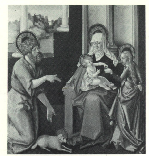
BALDUNG GRIEN. St. Anne with the Christ Child the Virgin, and St. John the Baptist

*11" x 14" color reproduction with texts for sale this week-25¢ each. If mailed, 35¢ each.