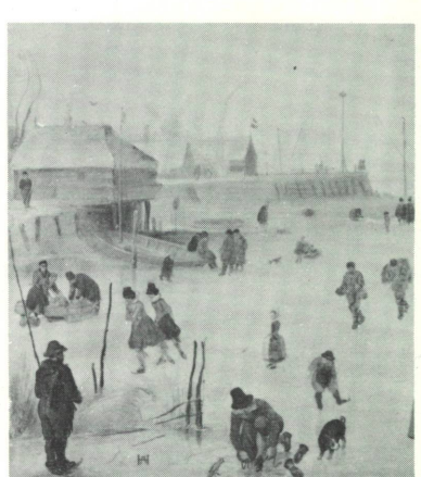
A Scene on the Ice (detail) Ailsa Mellon Bruce Fund

The Gallery's Seventh Street door will be during the open Chinese exhibition to the site adjoining the National Gallery to the west, across Constitution Avenue from the National Archives Building. This site is being developed under a joint agreement between the National Gallery of Art and the Department of the Interior as a future National Sculpture Garden. Phase I has