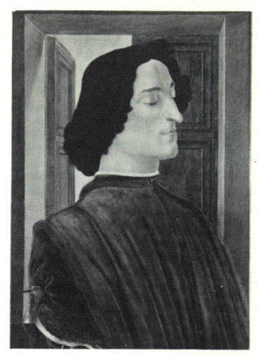
BOTTICELLI. Giuliano de'Medici