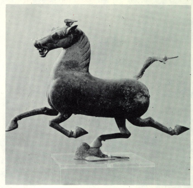
Bronze flying horse Eastern Han Dynasty, 2nd century A. D. Unearthed in 1969 in Wuwei, Kansu