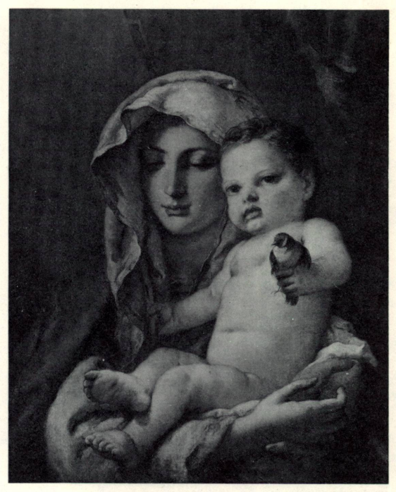
TIEPOLO. Madonna of the Goldfinch