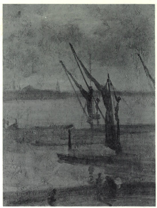
WHISTLER. Chelsea Wharf: Grey and Silver