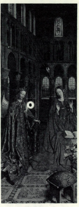
VAN EYCK. The Annunciation

All concerts, with intermission talks by members of the National Gallery Staff, are broadcast by Station WGMS-AM (570) and FM (103.5).