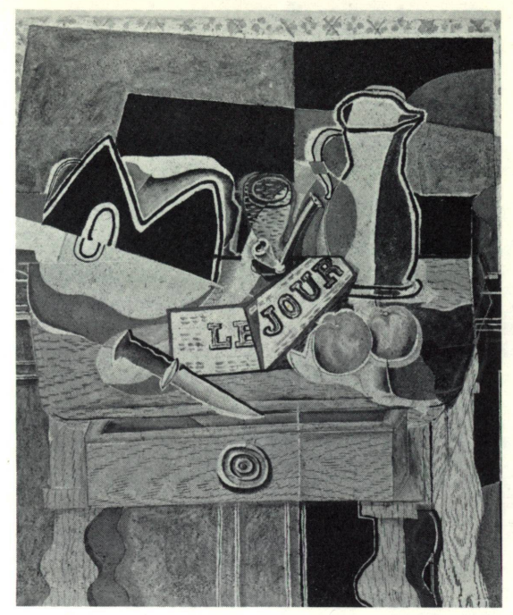
BRAQUE. Still Life: Le Jour (detail)