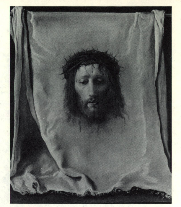
FETTI. The Veil of Veronica