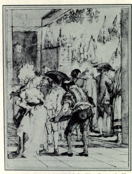
GIAN-DOMENICO TIEPOLO. The Grocer's Shop Anonymous loan