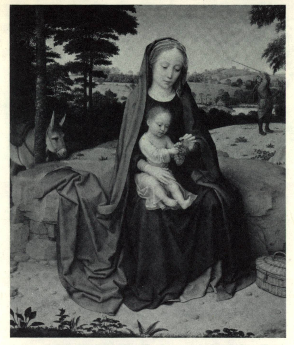
GERARD DAVID. The Rest on the Flight into Egypt