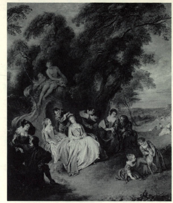
PATER. Fête Champêtre (detail)