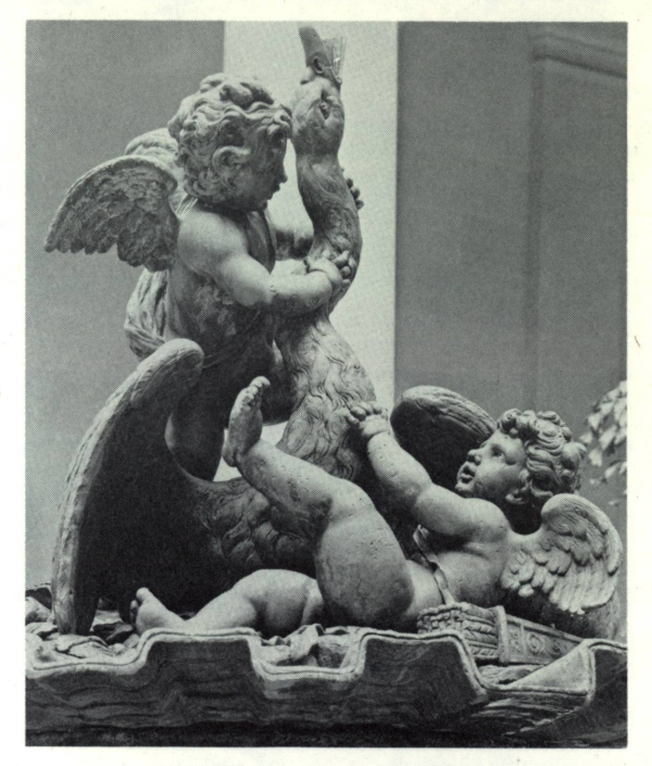
TUBI. Cherubs Playing With A Swan (detail)