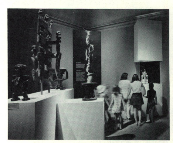
A view of some of the 150 objects, complemented by costumes, film and sound, in African Art and Motion , the Gallery's current special exhibition.

A selection of forty-eight prints by M. C. Escher from the recent donation of Mr. C. V. S. Roosevelt is on view in the Corridor Gallery through November. The exhibition traces the development of Escher's work, ending with his enigmatic prints of the 1950s, which reflect the artist's fascination with interlocking shapes and optically baffling spatial relationships.