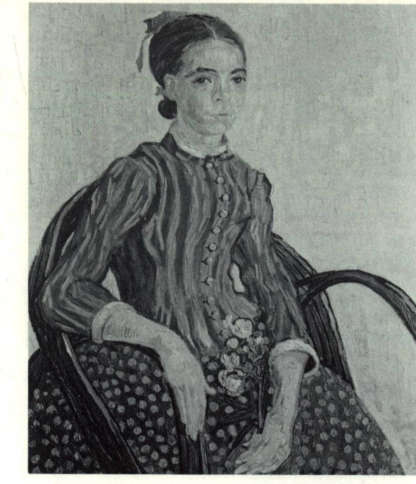
VAN GOGH. La Mousme