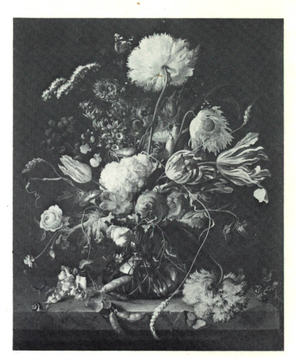
DE HEEM. Vase of Flowers