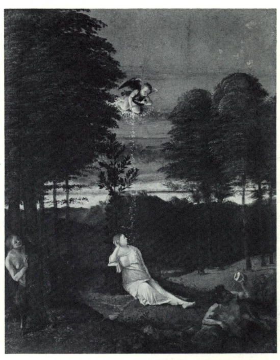
LOTTO. A Maiden's Dream