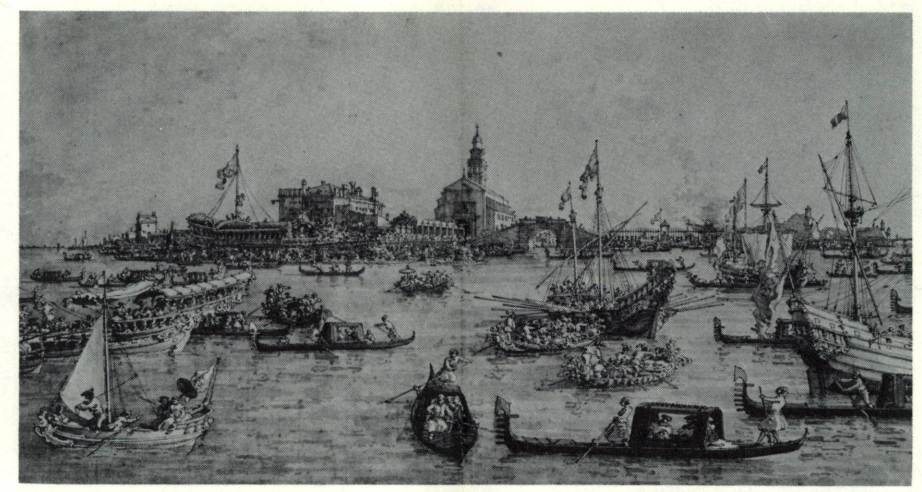
CANALETTO. Ascension Day Festival at Venice (detail) Samuel H. Kress Collection National Gallery of Art, Washington