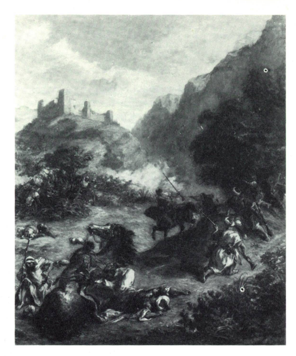
DELACROIX. Arabs Skirmishing in the Mountains

*11" x 14" color reproductions with texts for sale this week—25¢ each. If mailed, 35¢ each.