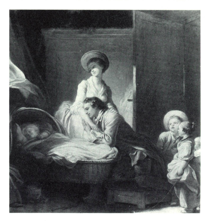
FRAGONARD. The Visit to the Nursery (detail)