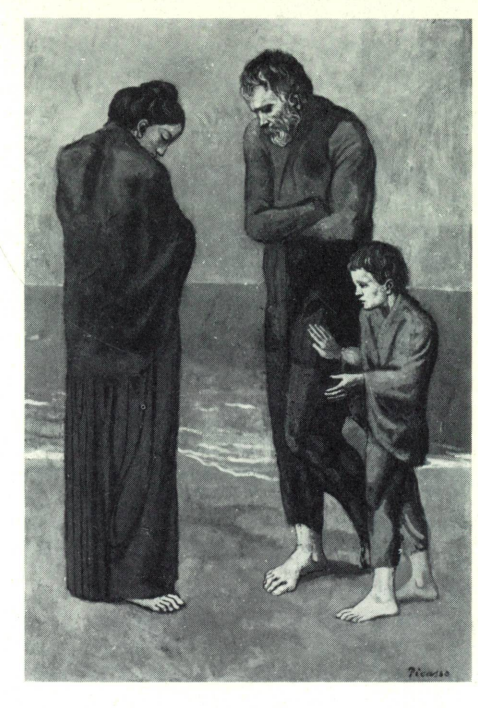
Picasso. The Tragedy

For reproductions and slides of the collection, books and other related publications, self-service rooms are open daily near the Constitution Avenue entrance.