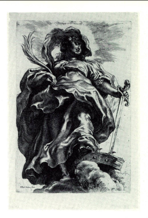
Rubens. Saint Catherine of Alexandria in the Clouds Ailsa Mellon Bruce Fund

Over 150 original works of art are complemented by five motion stations with displays of figures in original costumes and film sequences and recordings. The films, shot on location in Africa, show figures participating in ritual dance ceremonies. The ceremonial dances illustrate the dynamism of African art in its context of African music and dance, bringing one reviewer to say that the exhibition "is the first I have seen that seriously attempts to come to grips with the question of what African art means to Africans."