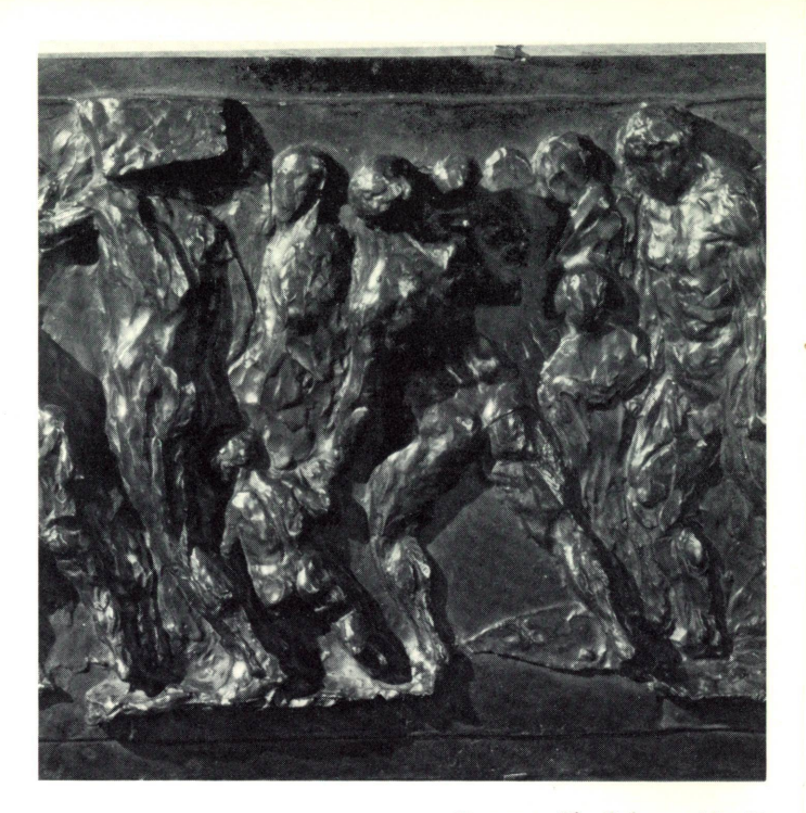
DAUMIER. The Refugees (detail)