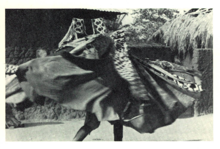
Egungun dancer

A loan exhibition of African art approached from a new viewpoint will open at the National Gallery May 5. (Please note that the originally announced opening date of April 28 has been changed to May 5.) Unlike a previous show at the Gallery, restricted to African sculpture, this exhibition will survey the variety of Sub-Saharan African visual creativity—including masks, sculpture, textiles and jewelry in the context of their relation to motion: implied, arrested or expressed. Film, recording, and the first use of videotape in field research will illustrate rarely-seen dances and ceremonies. These "motion stations" will display costumed figures with masks and other ritual objects seen in the recorded sequences. The results of research by Professor Robert Thompson of Yale will be presented entirely through selections from the renowned collection of Katherine Coryton White of Los Angeles, who has acquired certain material specifically for this exhibition. African Art and Motion will be on view at the Gallery through September 22.