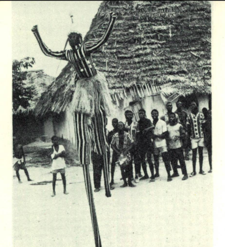
"Gle Gbee" dancer