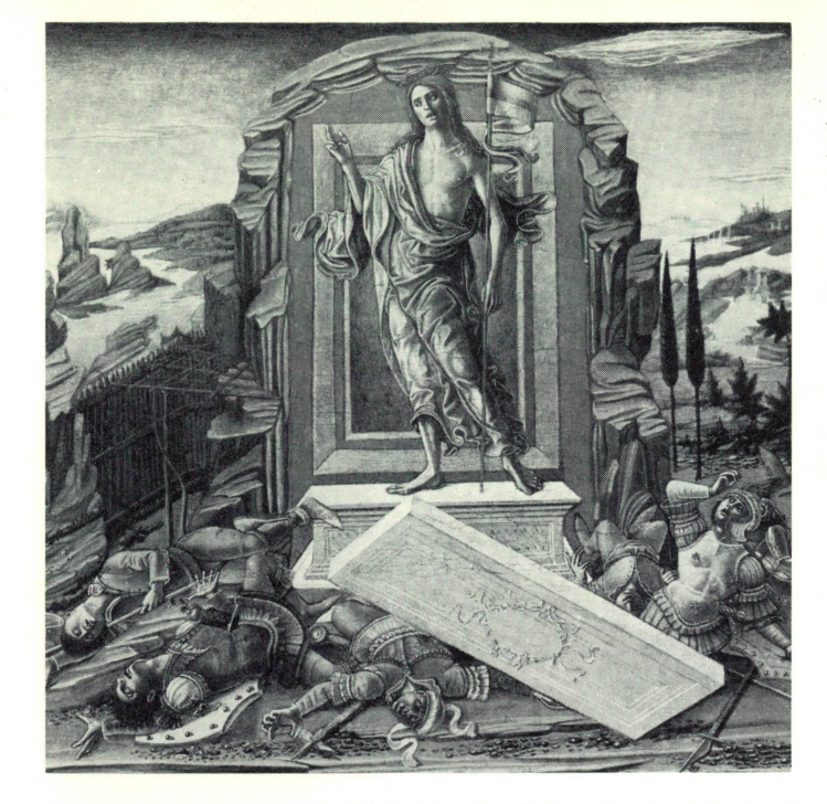
Benvenuto di Giovanni. The Resurrection (detail) from Passion of Our Lord