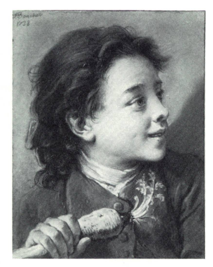
BOUCHER. Boy Holding a Carrot Academy, and director Lent by The Art Institute of Collection The Joseph and Helen Regenstein Collection

The National Gallery's exhibition of 100 drawings by François Boucher closes March 17. The artist's entire repertoire is represented, including nudes, pastorals, mythological and religious subjects, genre scenes and portraits. Many of the drawings served as designs for tapestries, porcelains, fountains and architectural decoration. As first painter to Louis XV, director of the Royal of the Gobelins and