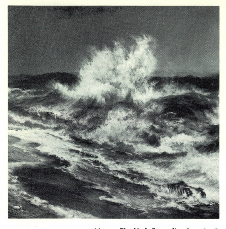
MORAN. The Much Resounding Sea (detail)