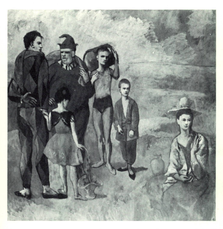
Picasso. Family of Saltimbanques (detail)