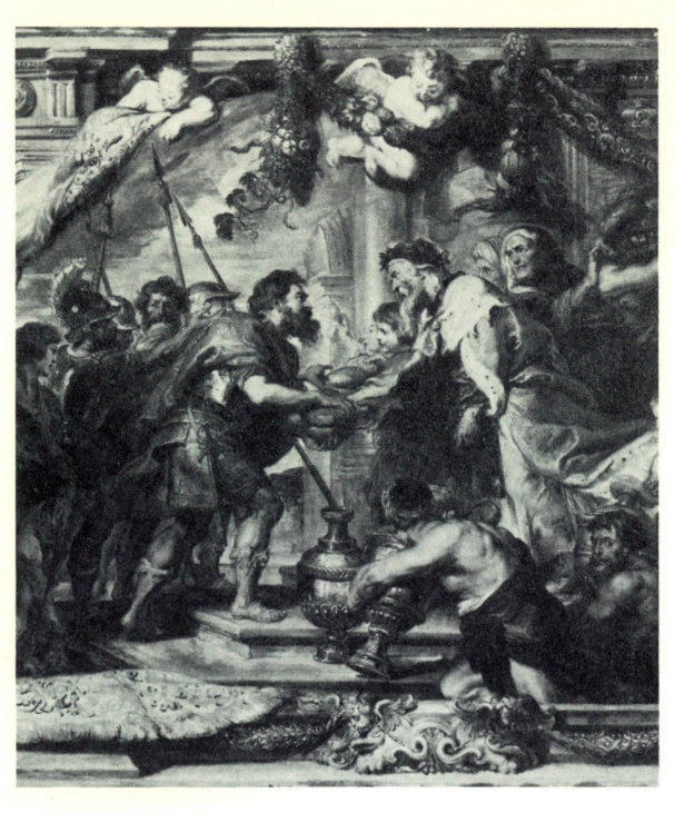
RUBENS. The Meeting of Abraham and Melchizedek (detail)

#8" x 10" black-and-white photographs for sale this week—75¢ each; descriptive text available at no charge.