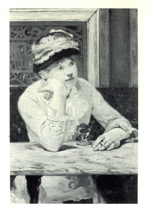
MANET. The Plum