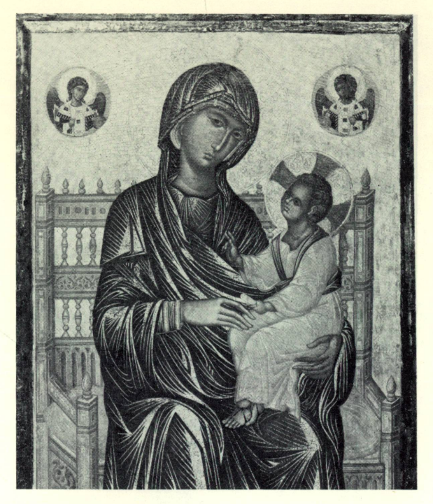
BYZANTINE, XIII CENTURY. Enthroned Madonna and Child (detail)

The Gallery is open weekdays and Saturdays 10:00 a.m. to 5:00 p.m., and Sundays 12 noon to 9:00 p.m.