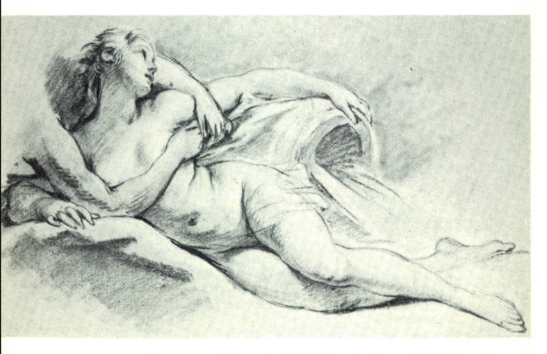
BOUCHER. A Nymph: Study for Apollo and Issé (detail) Lent by The Art Institute of Chicago The Joseph and Helen Regenstein Collection

The exhibition of one hundred drawings by François Boucher continues on view through March 17. Great interest in this exhibition, which reviews the work of the reigning artist of eighteenth-century France, has been shown by both critics and visitors. Paintings by Boucher and porcelains, prints, tapestries, book illustrations and French furniture are displayed in a period room presentation of the French rococo style. A leaflet on the exhibition is available without charge at the catalog desk. Written by the Gallery's Education Department, this leaflet contains an informative article on the rococo style, Boucher's numerous techniques, and his virtuosity as a draftsman. A fully illustrated catalog, with entries on each drawing and an introductory essay, is available both at the exhibition and in the Publications Rooms.