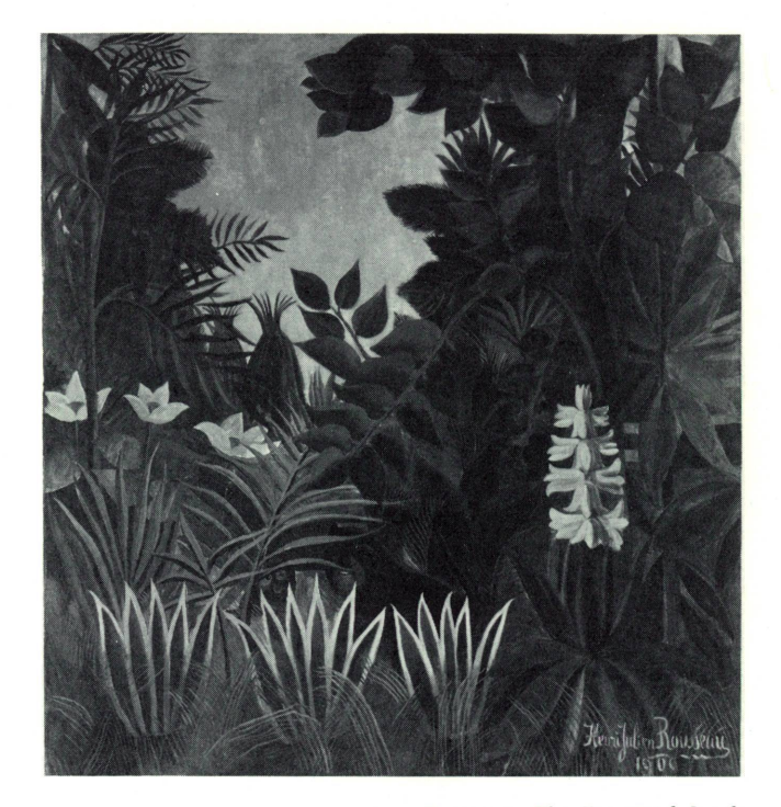
ROUSSEAU. The Equatorial Jungle