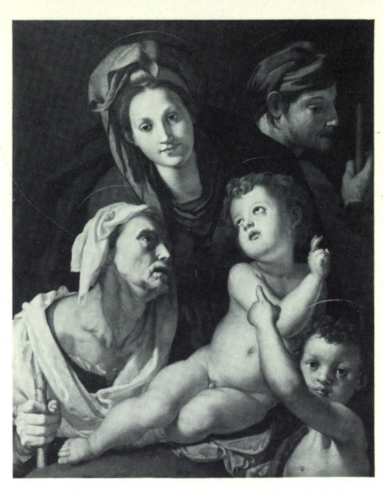
PONTORMO. The Holy Family

*11" x 14" color reproductions with texts for sale this week—25¢ each. If mailed, 35¢ each.