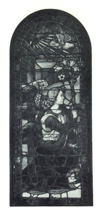
FLORENTINE, XV CENTURY. Angel of the Annunciation (Stained Glass Window)

For reproductions and slides of the collection, books and other related publications, self-service rooms are open daily near the Constitution Avenue entrance.