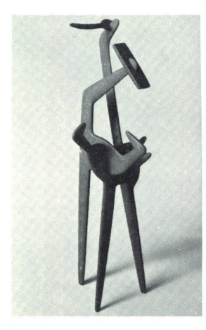
Noguchi. Strange Bird Collection of the Artist

A color portfolio of works in the exhibition, with an introductory essay by the noted specialist on twentieth-century art, William C. Seitz, is available. Educational offerings in conjunction with American Art at Mid-Century I include an acoustiguide tour of the exhibition, Tours of the Week, a Sunday Lecture and films. (See inside listings for details.)