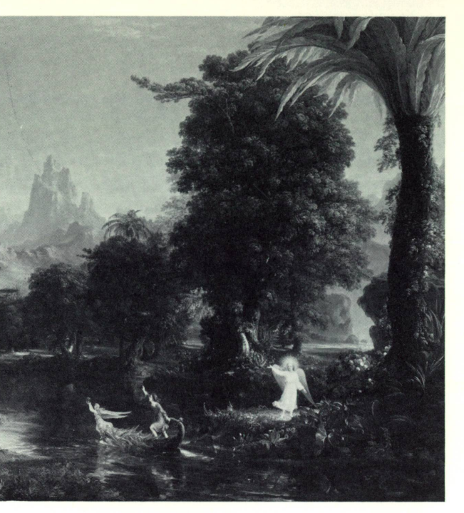
COLE. The Voyage of Life: Youth (detail)