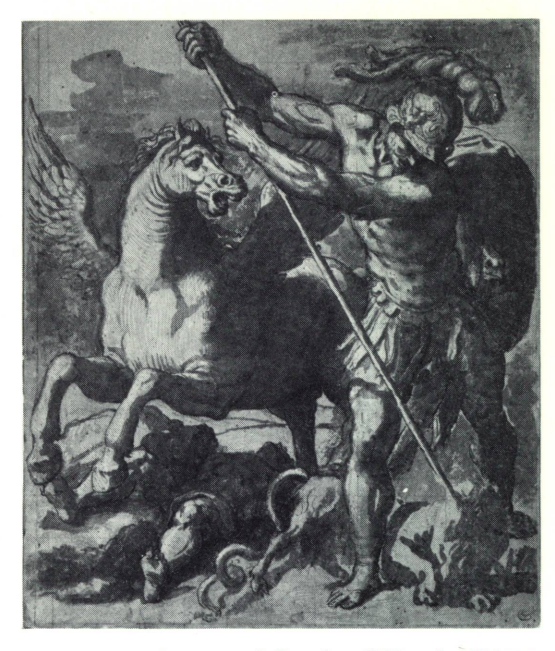
SALVIATI. Bellerophon Killing the Chimera Collection of Janos Scholz