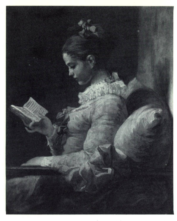
FRAGONARD. A Young Girl Reading

*11" x 14" color reproductions with texts for sale this week—25¢ each. If mailed, 35¢ each.