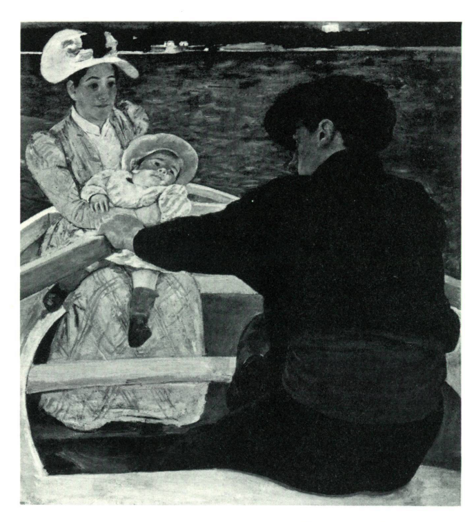
CASSATT. The Boating Party (detail)