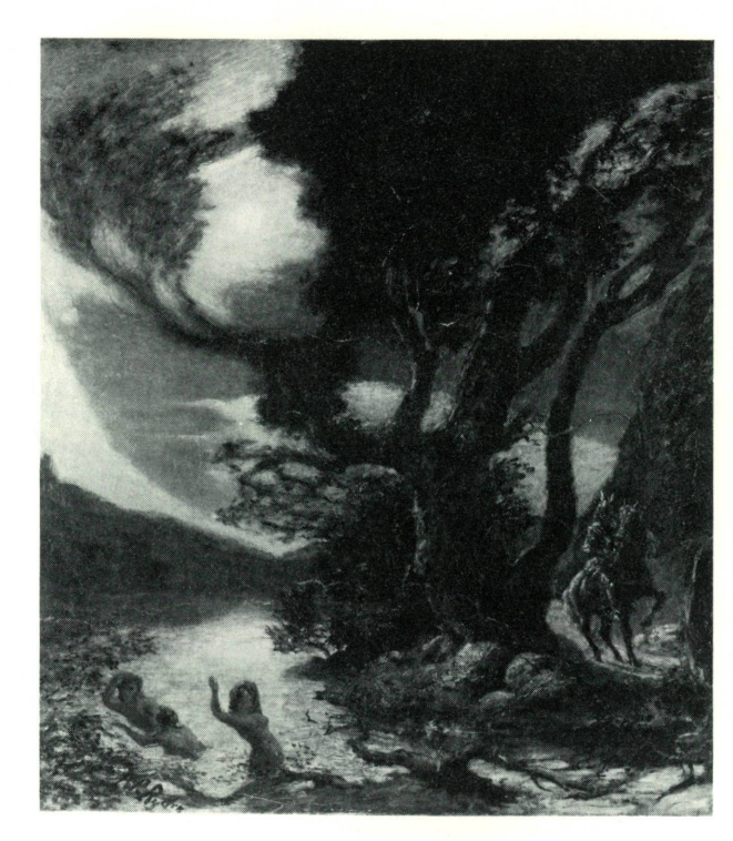
RYDER. Siegfried and the Rhine Maidens (detail)

The Gallery is open weekdays and Saturdays 10:00 a.m. to 9:00 p.m., and Sundays 12 noon to 9:00 p.m.