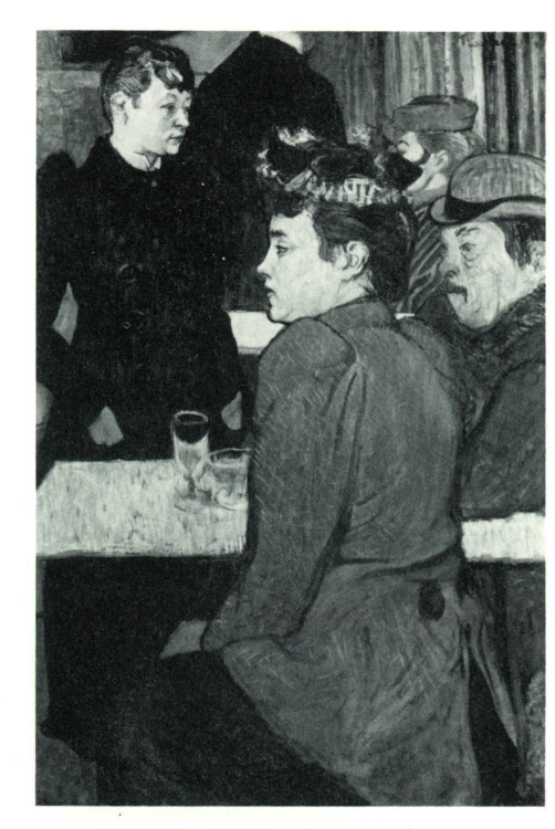
Toulouse-Lautrec. A Corner of the Moulin de la Galette (detail)

*11" x 14" color reproductions with texts for sale this week— 25\phi each. If mailed, 35\phi each.