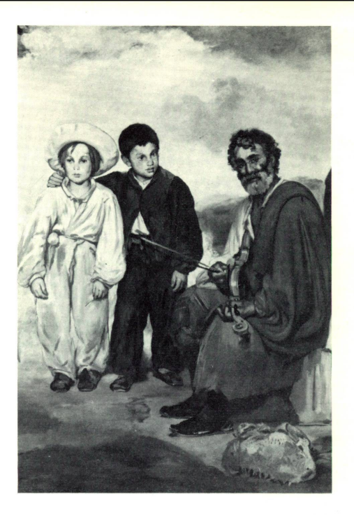
MANET. The Old Musician (detail)