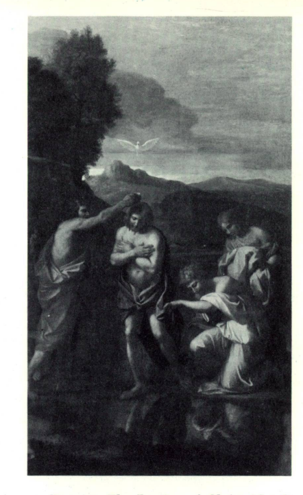
Poussin. The Baptism of Christ (detail)