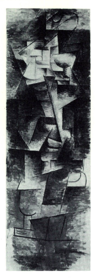
Pablo Picasso. Femme Nue Ailsa Mellon Bruce Fund