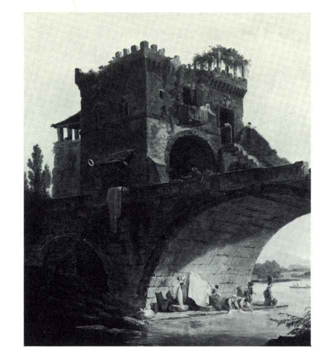
ROBERT. The Old Bridge (detail)