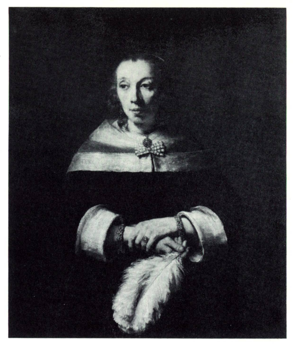
REMBRANDT. Portrait of a Lady with an Ostrich-Feather Fan