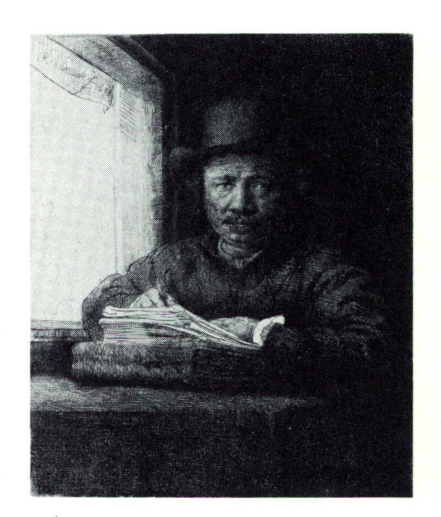
REMBRANDT. Self-Portrait, Drawing at a window Rosenwald Collection

An exhibition of 76 prints by Rembrandt belonging to the National Gallery continues on view in the print exhibition gal-leries (G-12 and G-19) through July. This exhibition has been organized by Christopher White, Curator of Graphic Arts, with the intention of showing the finest impressions in the Gallery's collection. The etchings on view demonstrate how Rembrandt worked on plates, often changing them as he proceeded, and how