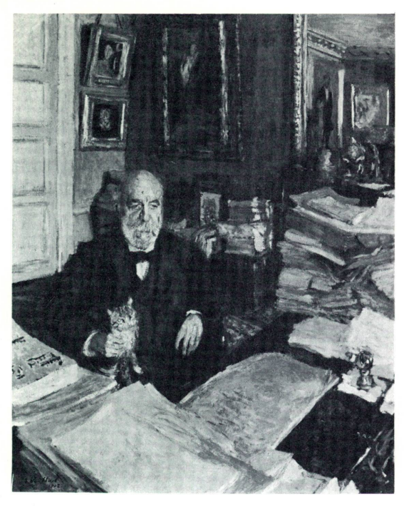
VUILLARD. Théodore Duret