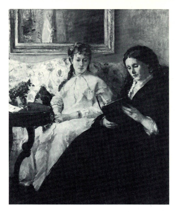
MORISOT. The Mother and Sister of the Artist