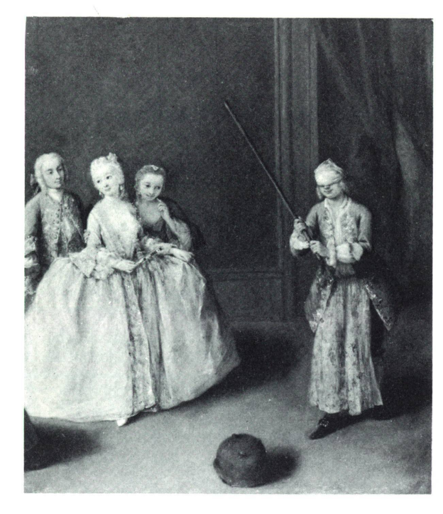
LONGHI. Blindman's Buff (detail)

*11" x 14" color reproductions with texts for sale this week— 25\phi each. If mailed, 35\phi each.