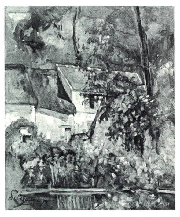
CÉZANNE. House of Père Lacroix