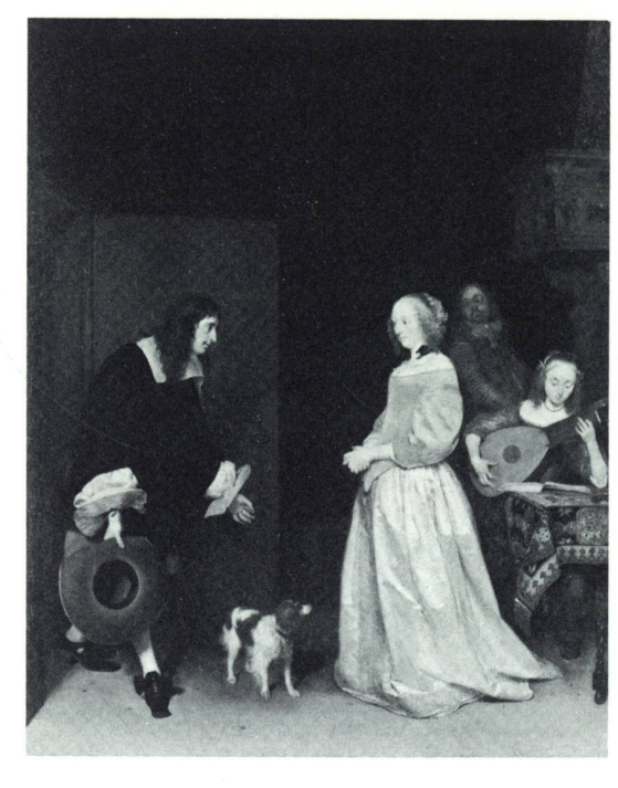
TER BORCH. The Suitor's Visit (detail)

All concerts, with intermission talks by members of the National Gallery Staff, are broadcast by Station WGMS-AM (570) and FM (103.5).