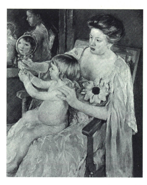
CASSATT. Mother and Child

For reproductions and slides of the collection, books, and other related publications, self-service rooms are open daily near the Constitution Avenue entrance.