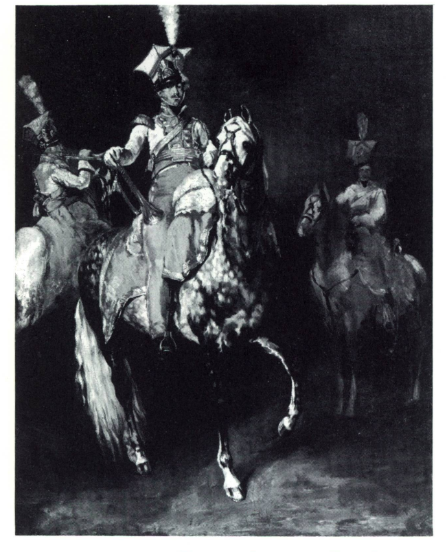
THÉODORE GÉRICAULT. Three Trumpeters Chester Dale Fund