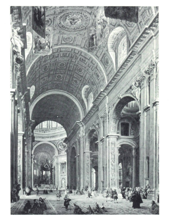
PANINI. Interior of Saint Peter's, Rome (detail)

For reproductions and slides of the collection, books, and other related publications, self-service rooms are open daily near the Constitution Avenue entrance.