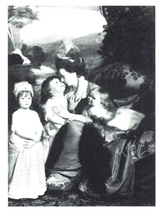
COPLEY. The Copley Family (detail)