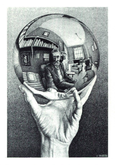
M. C. ESCHER. Handmade Reflecting Sphere. Rosenwald Collection

Prints by M. C. Escher. a selection of 39 woodcuts, wood engravings, lithographs and mezzotints by the Dutch printmaker M. C. Escher (1898-1972), drawn entirely from the Gallery's Rosenwald Collection, are exhibited in the print exhibition gallery (G-19) on the ground floor. On view through September, this selection of Escher's enigmatic prints reflects the artist's fascination with interlocking shapes and optically baffling spatial relationships.