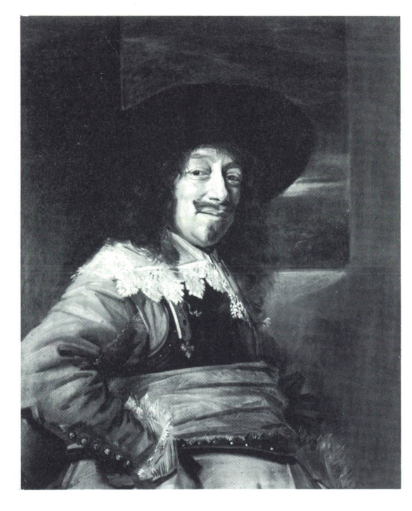
HALS. Portrait of an Officer

*11" x 14" color reproductions with texts for sale this week—25¢ each. If mailed, 35¢ each.