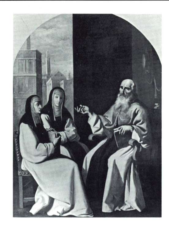
ZURBARÁN, Saint Jerome with Saint Paula and Saint Eustochium

*11" x 14" color reproductions with texts for sale this week—25¢ each. If mailed, 35¢ each.