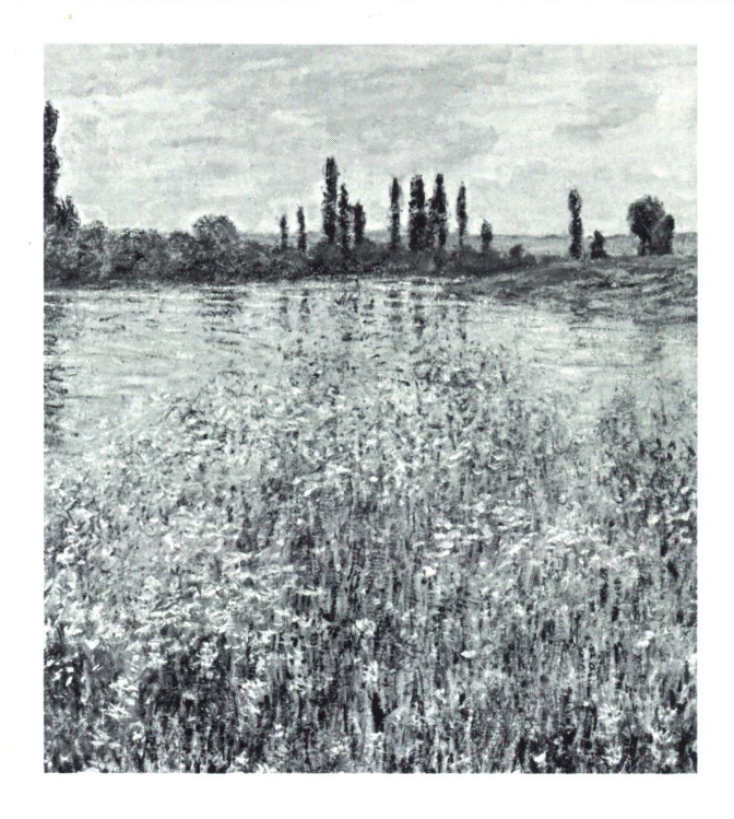
MONET. Banks of the Seine, Vétheuil (detail)