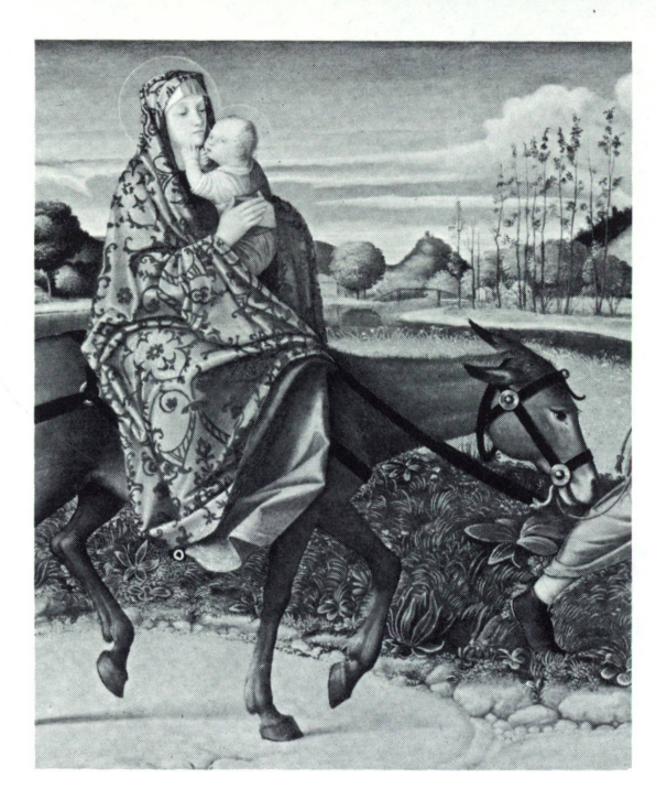
CARPACCIO. The Flight into Egypt (detail)

For reproductions and slides of the collection, books, and other related publications, self-service rooms are open daily near the Constitution Avenue entrance.