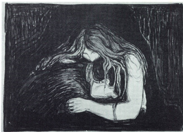
EDVARD MUNCH. The Vampire Rosenwald Collection

Until Labor Day the Gallery will be open Monday through Saturday 10 a.m. to 9 p.m. and Sunday 12 to 9 p.m. The Gallery's cafeteria will be open Monday through Saturday 10 a.m. to 7:30 p.m. and Sunday 1 to 7 p.m.