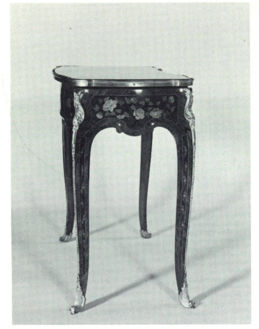
Lady's Dressing Table . French, c.1760