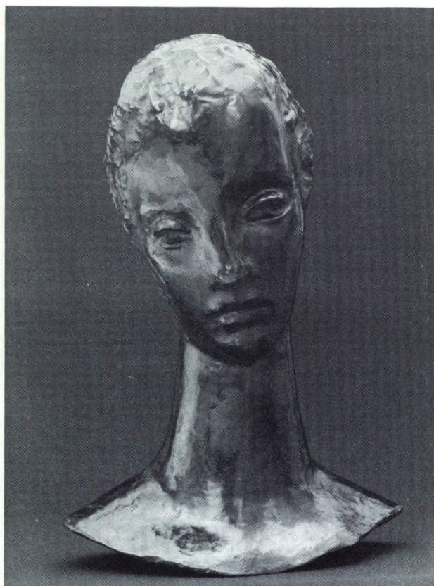
WILHELM LEHMBRUCK. Head of Woman with Slender Neck Wilhelm Lehmbruck Museum, Duisburg