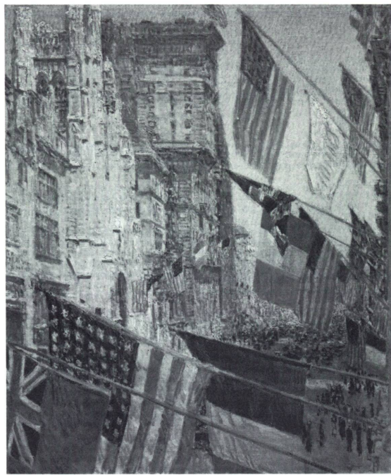
HASSAM. Allies Day , May 1917