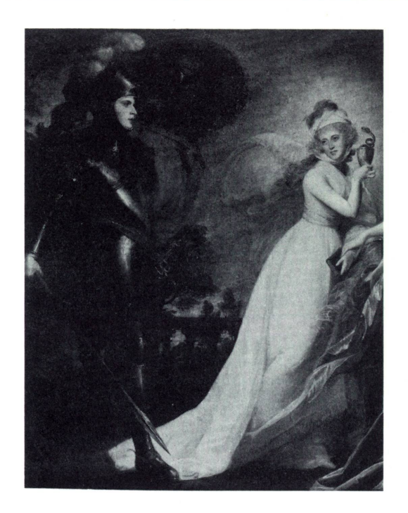
COPLEY. The Red Cross Knight (detail)