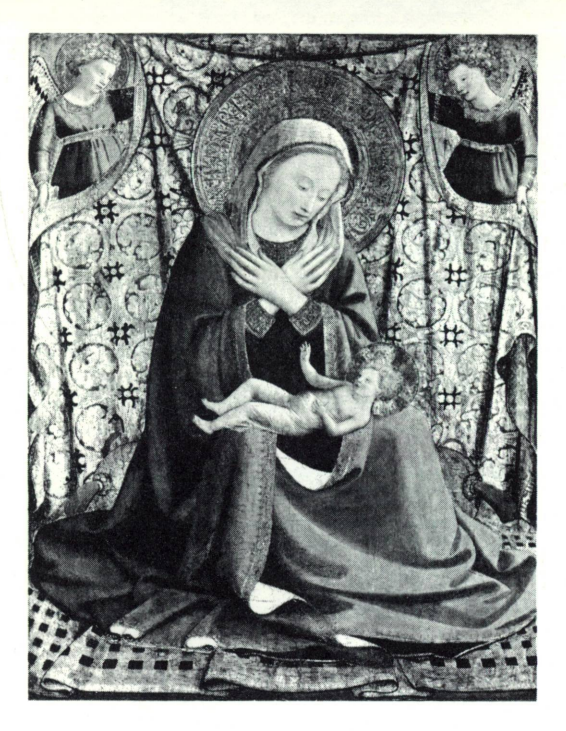
FRA ANGELICO. The Madonna of Humility

For reproductions and slides of the collection, books, and other related publications, self-service rooms are open daily near the Constitution Avenue entrance.