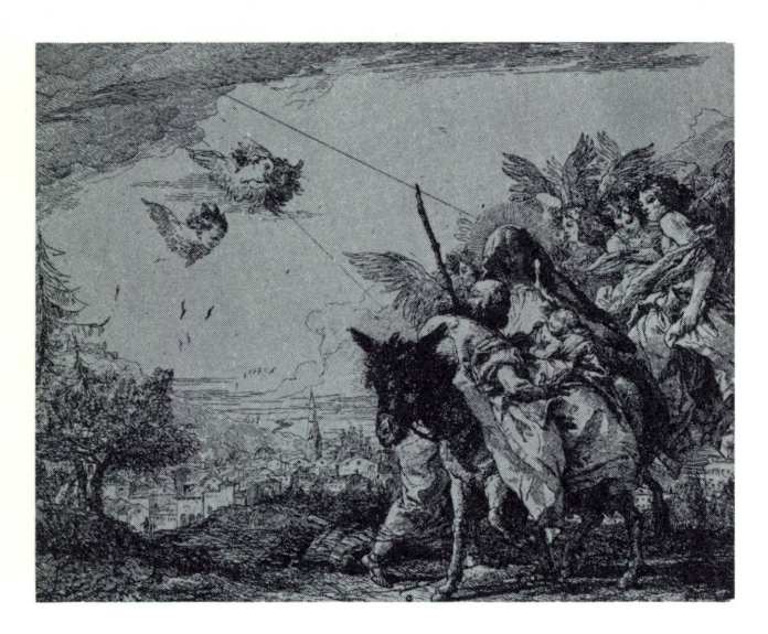
GIOVANNI DOMENICO TIEPOLO. Joseph, Standing, Adores the Child. Rosenwald Collection