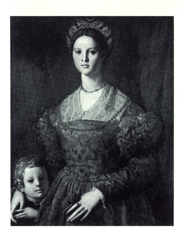
BRONZINO. A Young Woman and Her Little Boy

The gallery is open weekdays and Saturdays, 10:00 a.m. to 5:00 p.m., and Sundays, 12 noon to 9:00 p.m.