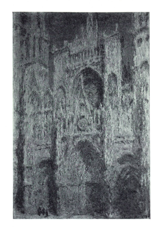
MONET. Rouen Cathedral, West Façade, Sunlight