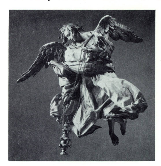
Angel with censer, attributed to Giuseppe Sammartino. Metropolitan Museum of Art, Gift of Loretta Howard 1964

A selection of 18th-century French prints, books, and drawings from the National Gallery's Widener Collection remains on view in the Print Exhibition Room, ground floor, through January 6.