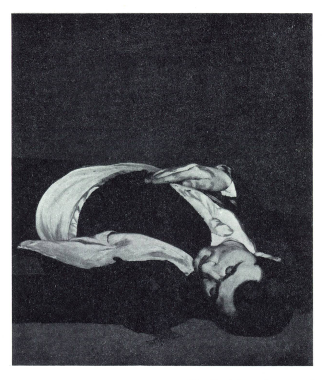
MANET. The Dead Toreador (detail)