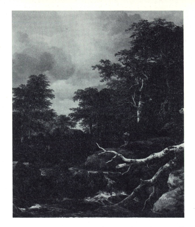
JACOB VAN RUISDAEL. Forest Scene (detail)