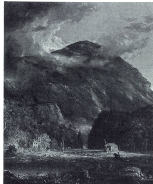
COLE. The Notch of the White Mountains (Crawford Notch) (detail)

All concerts, with intermission talks by members of the National Gallery Staff, are broadcast by Station WGMS-AM (570) and FM (103.5).