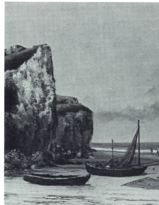
COURBET. Beach in Normandy (detail)

*11" x 14" reproductions with texts for sale this week—25¢ each. If mailed, 35¢ each.