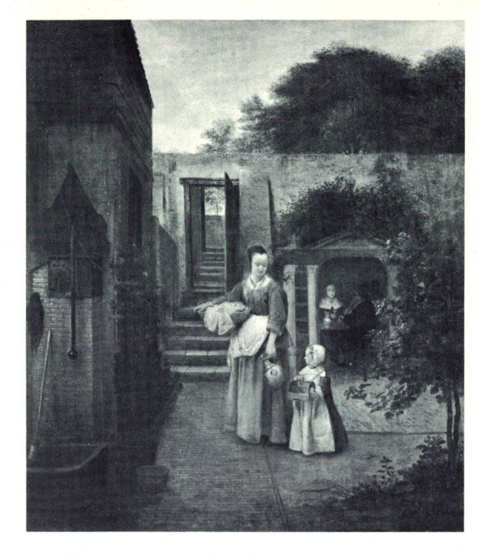
DE HOOCH. A Dutch Courtyard

MONDAY, Aug. 30, through SUNDAY, Sept. 5