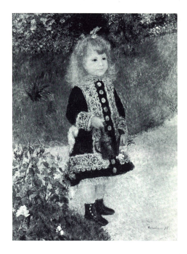
RENOIR. A Girl with a Watering Can