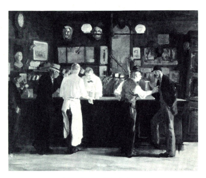
JOHN SLOAN. McSorley's Bar Lent by the Detroit Institute of Arts