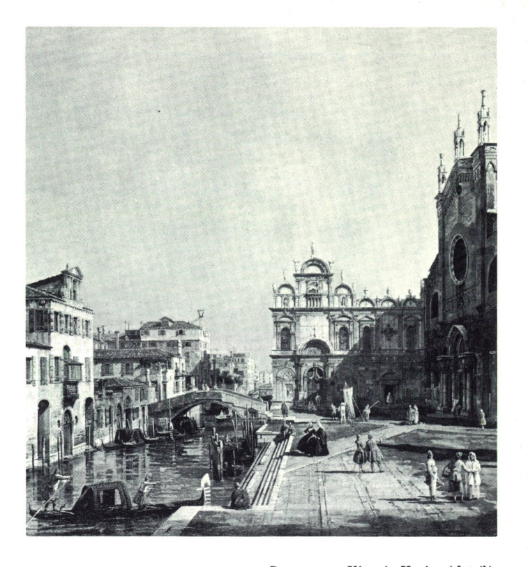
CANALETTO. View in Venice (detail)