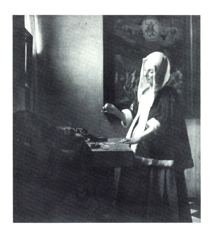
VERMEER. A Woman Weighing Gold