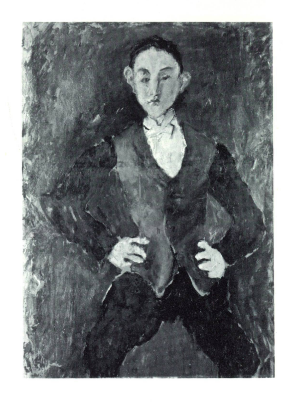
SOUTINE. Portrait of a Boy

MONDAY, July 26, through SUNDAY, August 1