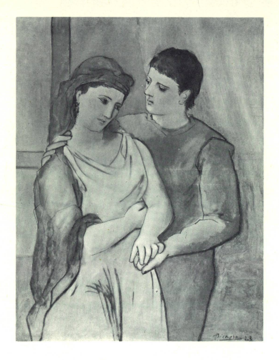
Picasso. The Lovers

For reproductions and slides of the collection, books, and other related publications, self-service rooms are open daily near the Constitution Avenue entrance.