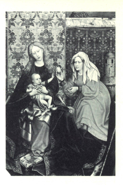
Master of Flémalle and Assistants. Madonna and Child with Saints in the Enclosed Garden

#Color postcards with texts for sale this week—10¢ each, postpaid.