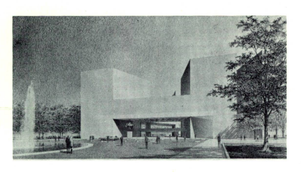
Rendering of East Building - view of west façade