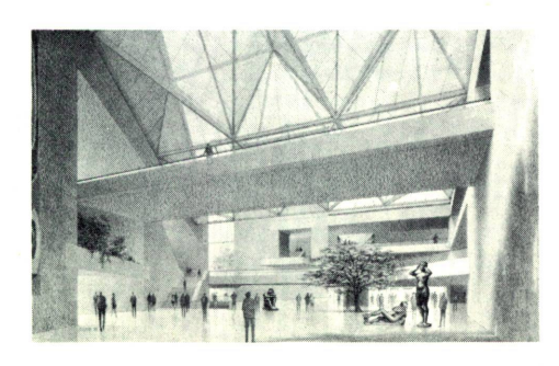
Rendering of East Building - view of main lobby

The new construction will also house a Center for Advanced Study in the Visual Arts, and much-needed space for expanding educational, scholarly, and administrative functions.