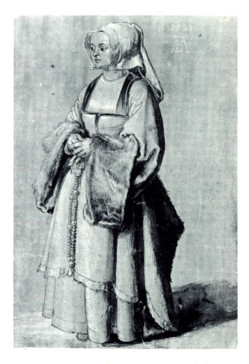
Dürer. Young Woman in Netherlandish Dress Widener Collection

A section on print connoisseurship, containing 50 comparative impressions with texts and explanatory labels, is part of the exhibition. A definitive, 364-page catalogue is available with extensive treatment of 36 drawings, 80 engravings and 127 woodcuts, all illustrated. Guided tours by the Gallery's Education Department lecturers have been developed to complement the exhibition and aid the visitor. An Acoustiguide tour is available.