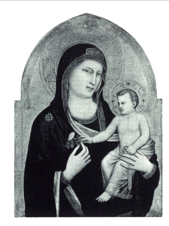
GIOTTO, Madonna and Child

*11" x 14" reproductions with texts for sale this week—15¢ each. If mailed, 25¢ each.