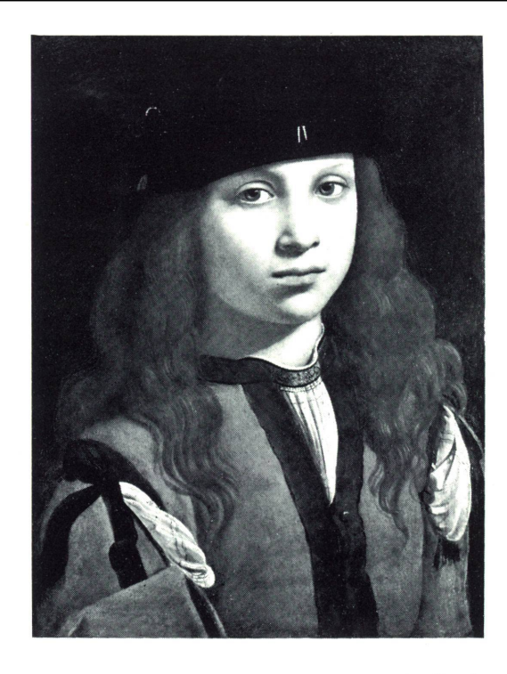
BOLTRAFFIO. Portrait of a Youth