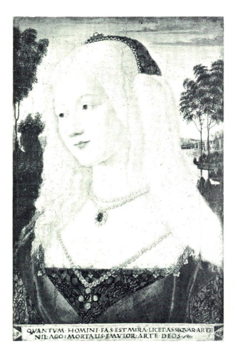
NEROCCIO DE'LANDI. Portrait of a Lady