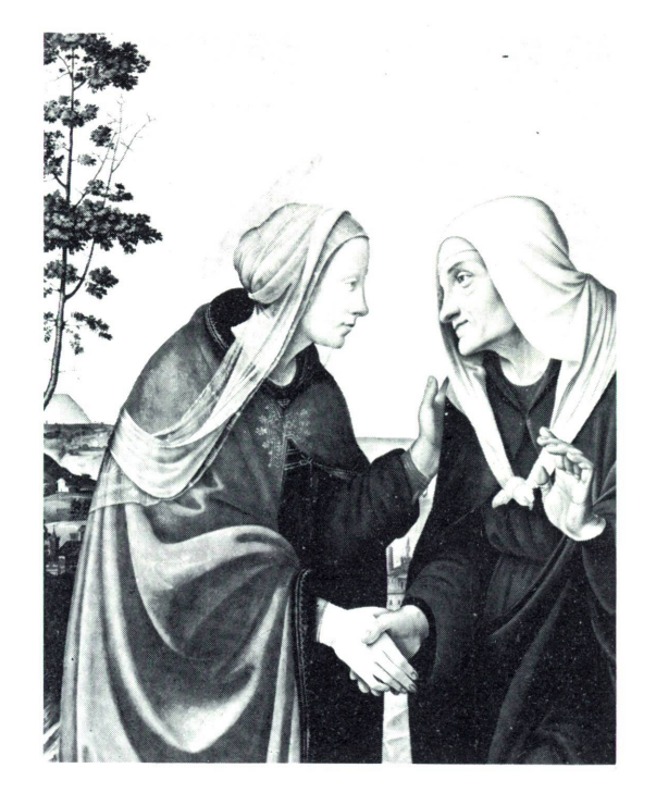
PIERO DI COSIMO. The Visitation with Saint Nicholas and Saint Anthony Abbot (detail)