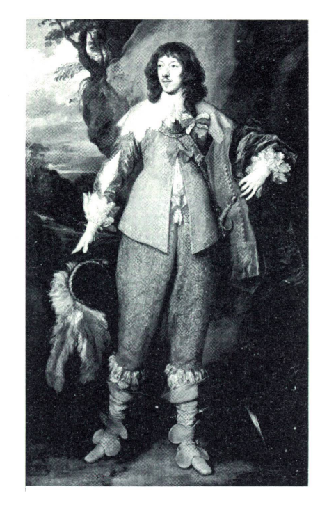
VAN DYCK. Henri II de Lorraine, Duc de Guise

*11" x 14" reproductions with texts for sale this week— 15¢ each. If mailed, 25¢ each.