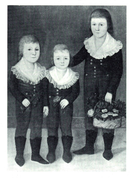
JOSHUA JOHNSTON. The Westwood Children (detail)

All concerts, with intermission talks by members of the National Gallery Staff, are broadcast by Station WGMS-AM (570) and FM (103.5).