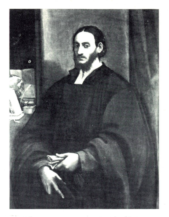
SEBASTIANO DEL PIOMBO. Portrait of a Humanist