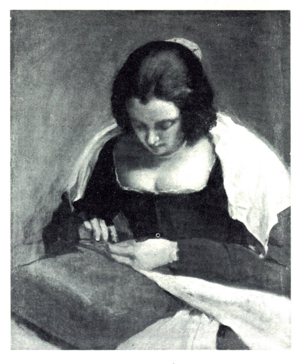
VELÁZQUEZ. The Needlewoman

*11" x 14" reproductions with texts for sale this week— 15¢ each. If mailed, 25¢ each.