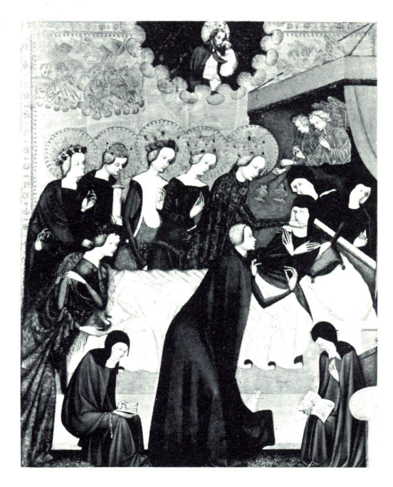
MASTER OF HEILIGENKREUZ. The Death of Saint Clare