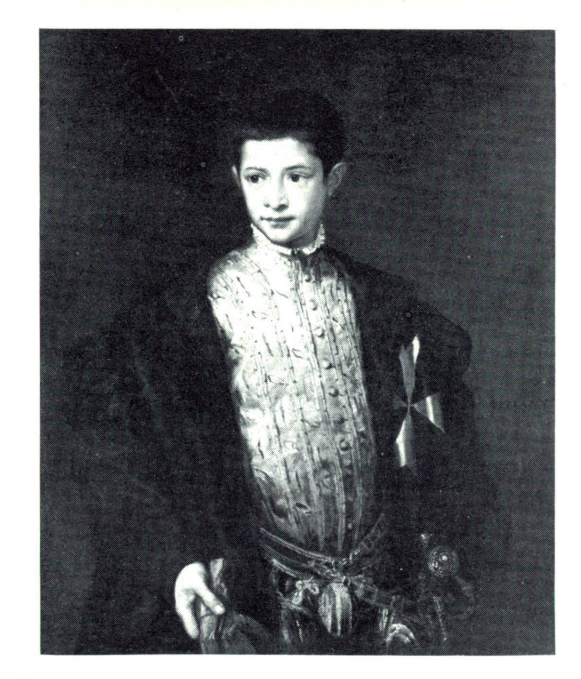
TITIAN. Ranuccio Farnese

*11" x 14" reproductions with texts for sale this week—15¢ each. If mailed, 25¢ each.