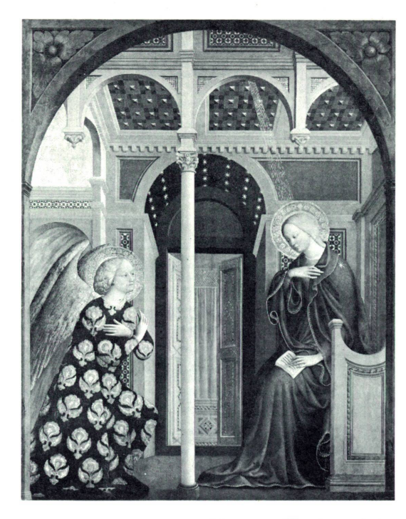
MASOLINO. The Annunciation

27th American Music Festival: National Gallery Orchestra Richard Bales, Conductor East Garden Court 8:00