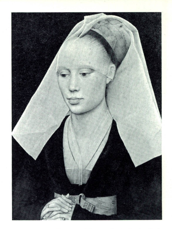
VAN DER WEYDEN. Portrait of a Lady

"Civilisation" showings continue daily in the Auditorium. For information telephone 737-4220.