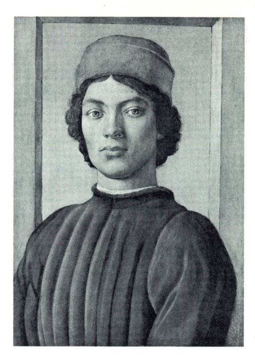
FILIPPINO LIPPI. Portrait of a Youth

For reproductions and slides of the collection, books, and other related publications, self-service rooms are open daily near the Constitution Avenue entrance.