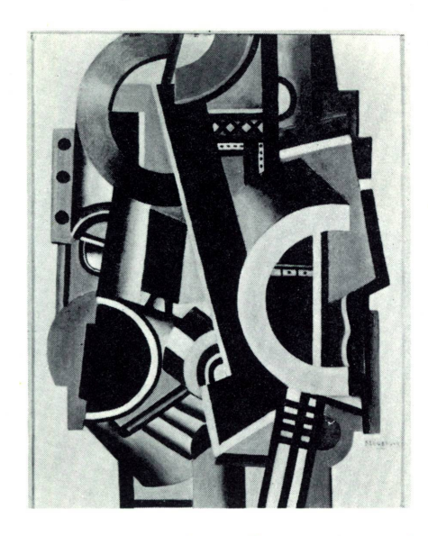
LEGER. Elément mécanique I Smith College Museum of Art