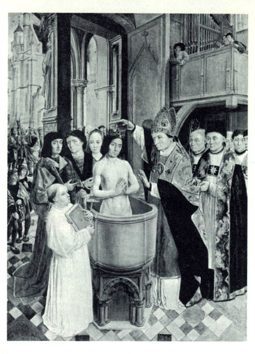
MASTER OF SAINT GILLES. The Baptism of Clovis

All concerts, with intermission talks by members of the National Gallery staff, are broadcast by Station WGMS-AM (570) and FM (103.5).