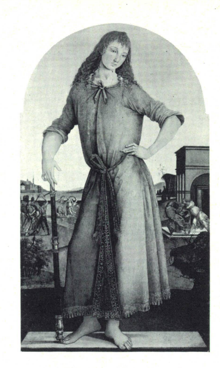
SIGNORELLI. Eunostos of Tanagra