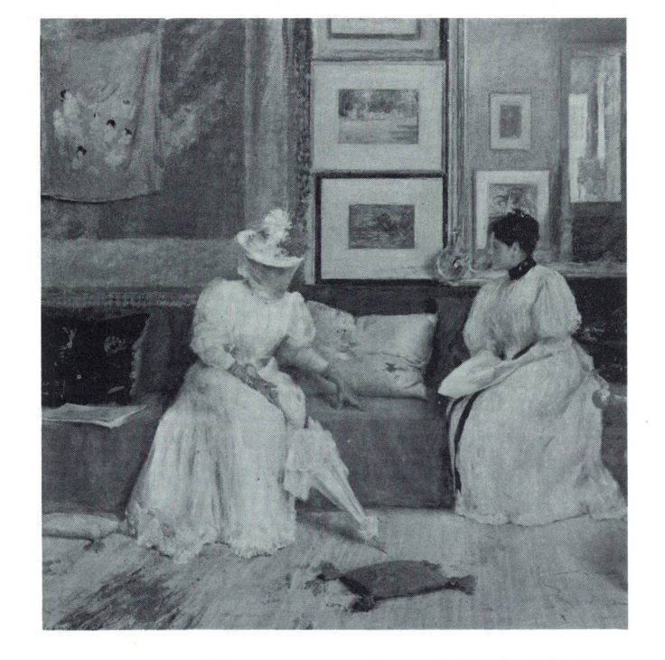
WILLIAM MERRITT CHASE. A Friendly Call (detail)