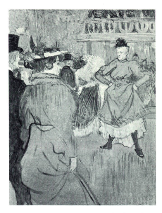
TOULOUSE-LAUTREC. Quadrille at the Moulin Rouge

MONDAY, Sept. 29, through SUNDAY, Oct. 5