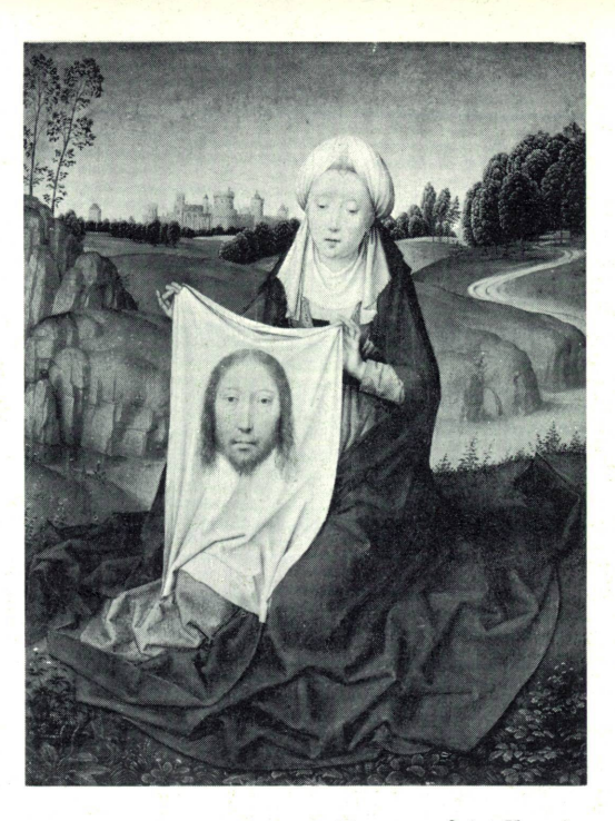
MEMLING. Saint Veronica

All concerts, with intermission talks by members of the National Gallery Staff, are broadcast by Station WGMS-AM (570) and FM (103.5).