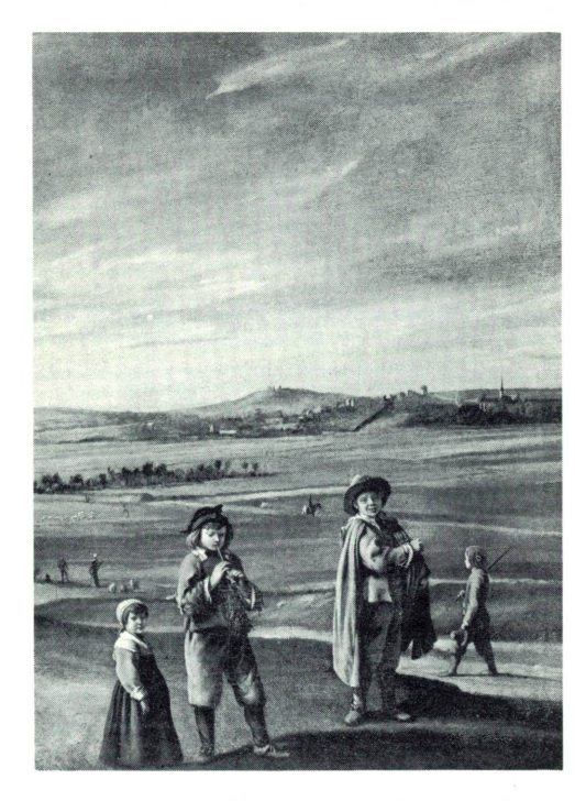
Louis Le Nain. Landscape with Peasants (detail)

*11" x 14" reproductions with texts for sale this week — 15¢ each. (If mailed, 25¢ each.)