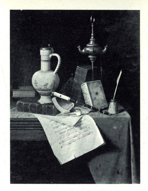
HARNETT. My Gems

For reproductions and slides of the collection, books, and other related publications, self-service rooms are open daily near the Constitution Avenue Entrance.