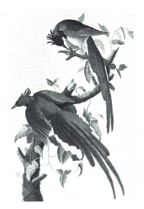
AUDUBON. Columbia Iau