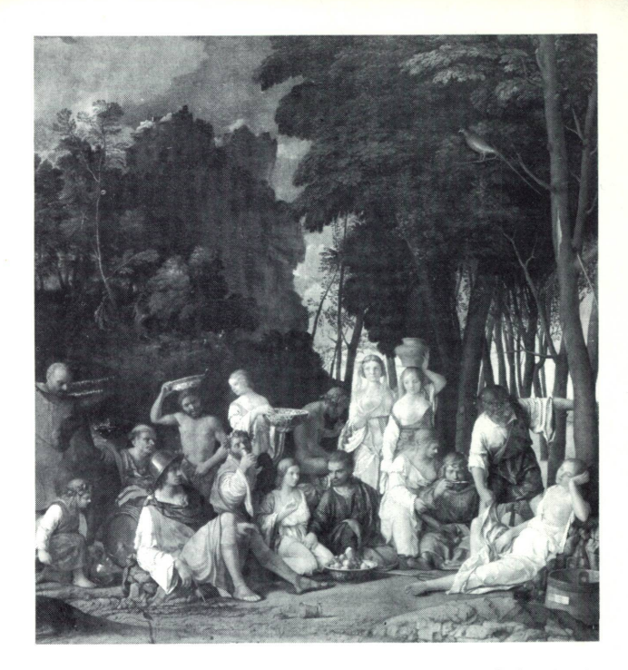
Bellini. The Feast of the Gods (detail)

Weekdays, 10 a.m. to 4 p.m., luncheon service 11 a.m. to 2:30 p.m. Sundays, dinner service 2 p.m. to 7 p.m.