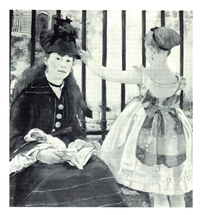
MANET. Gare Saint-Lazare (detail)