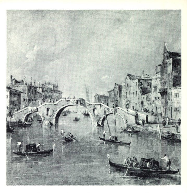
FRANCESCO GUARDI. View on the Cannaregio, Venice (detail)

Weekdays 10 a.m. to 4 p.m., luncheon service 11 a.m. to 2:30 p.m. Sundays dinner service 2 p.m. to 7 p.m.