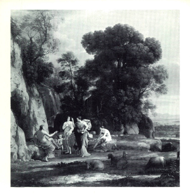
CLAUDE LORRAIN. The Judgment of Paris (detail)