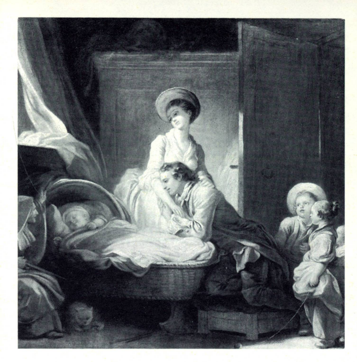
FRAGONARD. The Visit to the Nursery (detail)

Inquiries concerning the Gallery's educational services should be addressed to the Educational Office or telephoned to 737-4215, ext. 272.