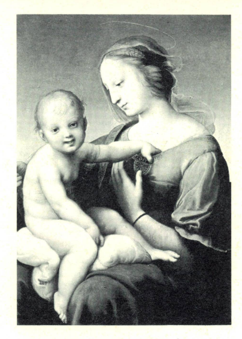
RAPHAEL. The Niccolini-Cowper Madonna

*11" x 14" reproductions with texts for sale this week — 15¢ each. (If mailed, 25¢ each.)