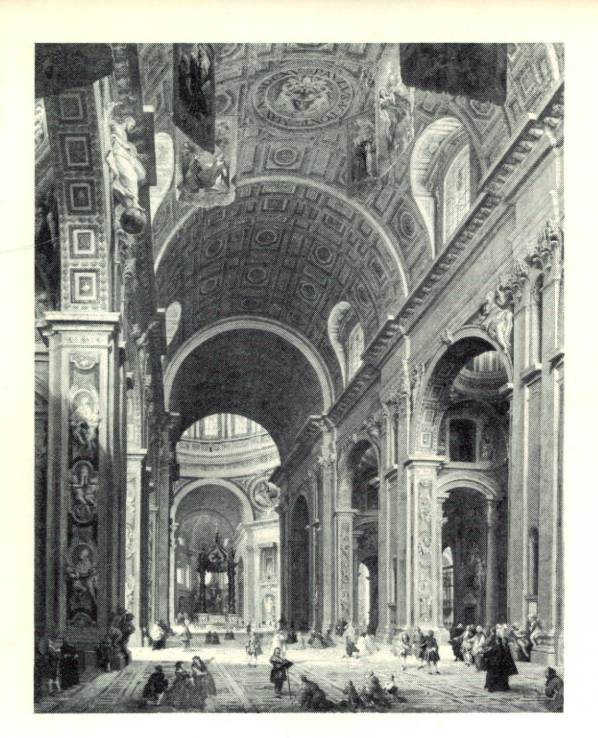
PANINI. Interior of Saint Peter's, Rome (detail)